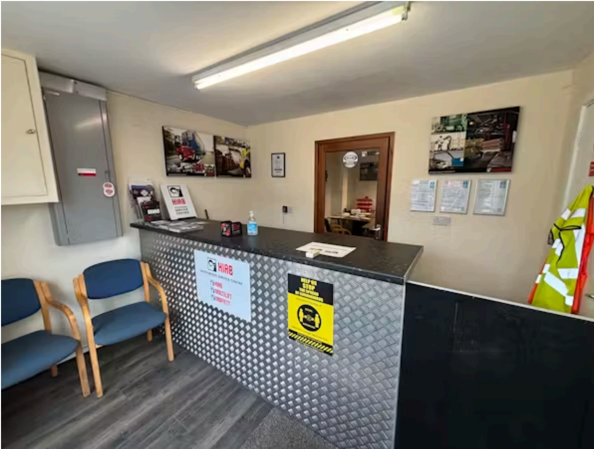
Unit 6, Tollgate Close, Cardiff, CF11 8TN