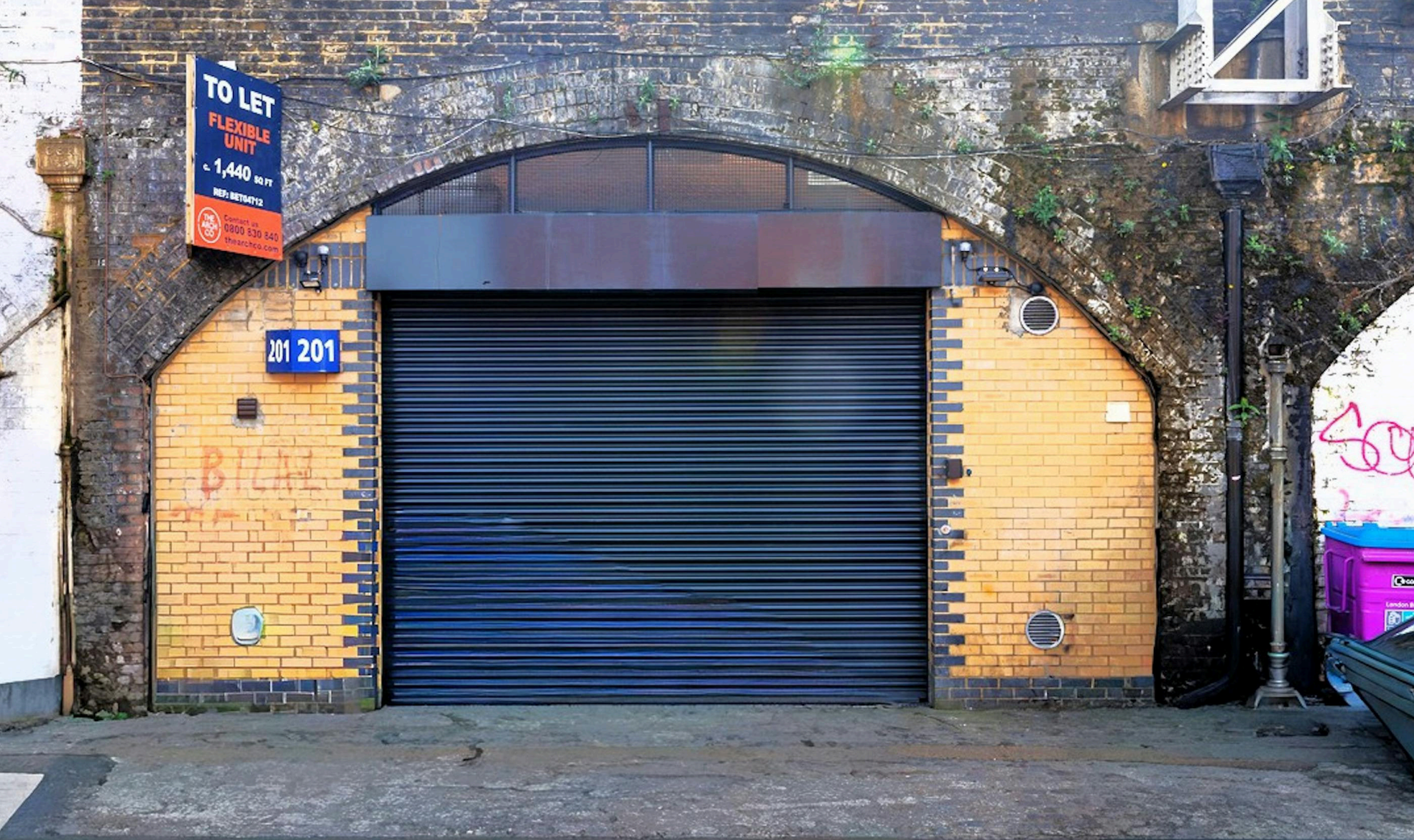
Arch 201, Three Colts Lane, Bethnal Green, London, E2 6JN Industrial To Let | £34,250 per annum | 1,440 sq ft Refurbished Industrial Unit with an Electric Roller Shutter, Glazed Frontage and Gas Meter & Supply.