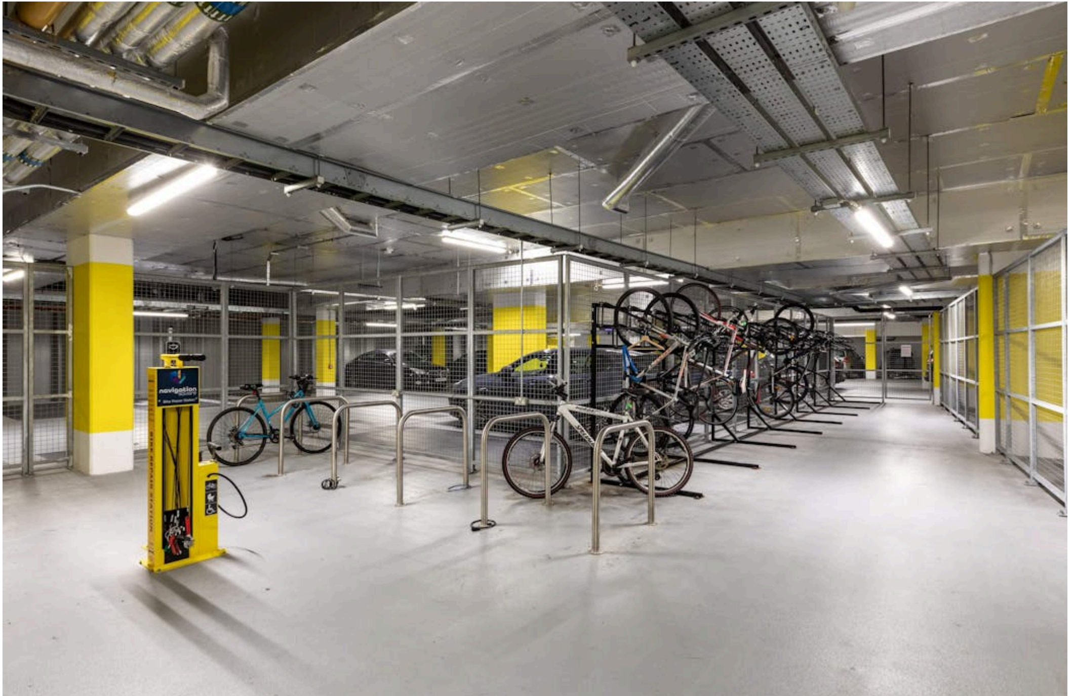
Clearstream Global Security Services, Nsq 1, Navigation Square, Albert Quay, Cork, T12H682