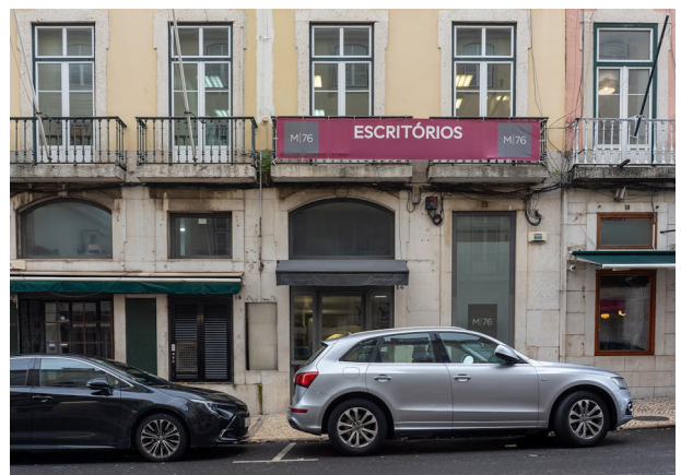
Remolares 14, Rua Remolares 14, Lisboa, 1200-371