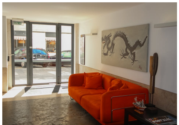
Remolares 14, Rua Remolares 14, Lisboa, 1200-371