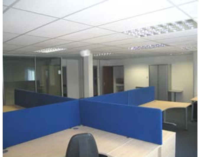
*ground floor photo