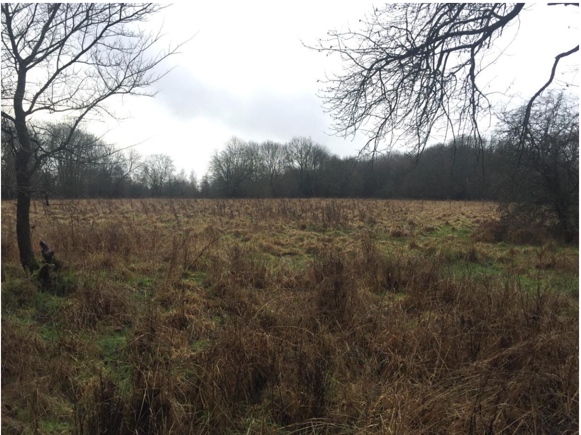
View from within the site looking east