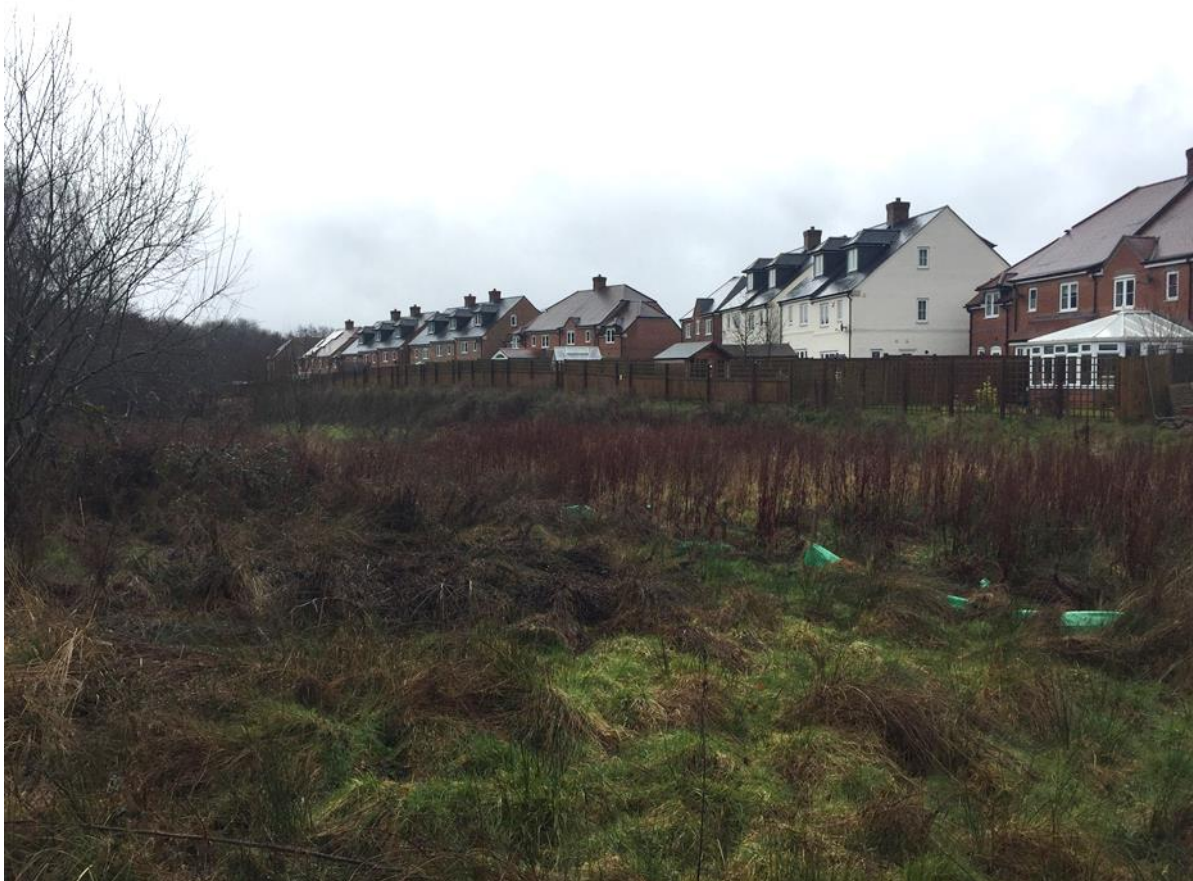
View from within the site looking south west