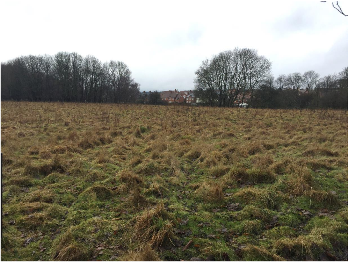
View from within the site looking south west