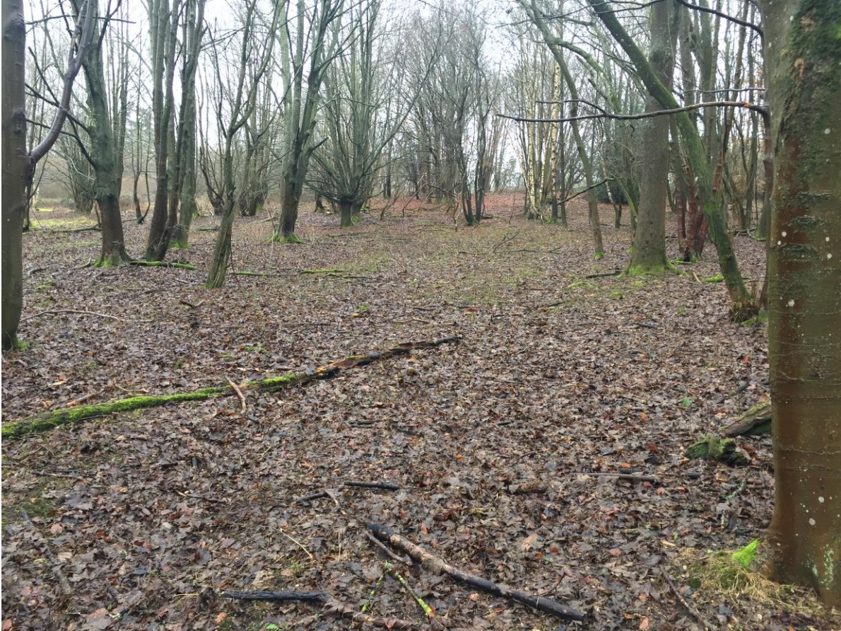
View from within the site looking north