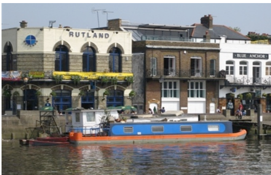
Riverside Pubs (Rutland Arms & Blue Anchor)