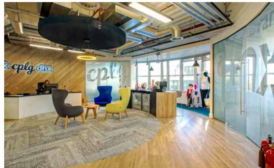
reception 2nd floor