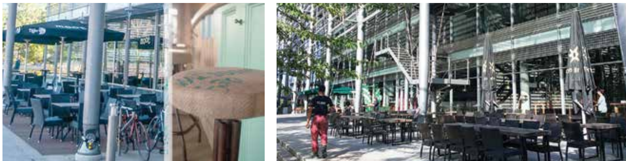
The on-site facilities include a choice of restaurants, cafés, bars and shops including Starbucks, Source, WH Smith and the Moot Bar together with the Virgin Active health and fitness club.