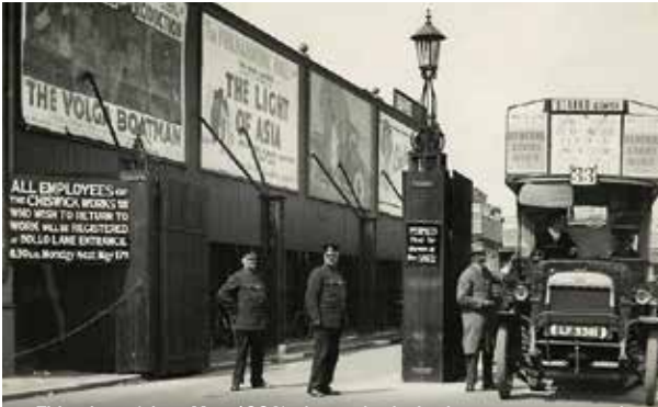
This photo (circa May 1926) shows the invitation to return to work posted at the Chiswick bus depot at the end of the General Strike (now the site of Chiswick Park).