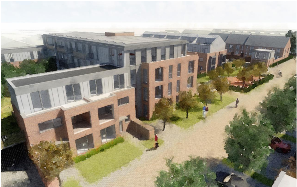
CGI image of the proposed development looking east