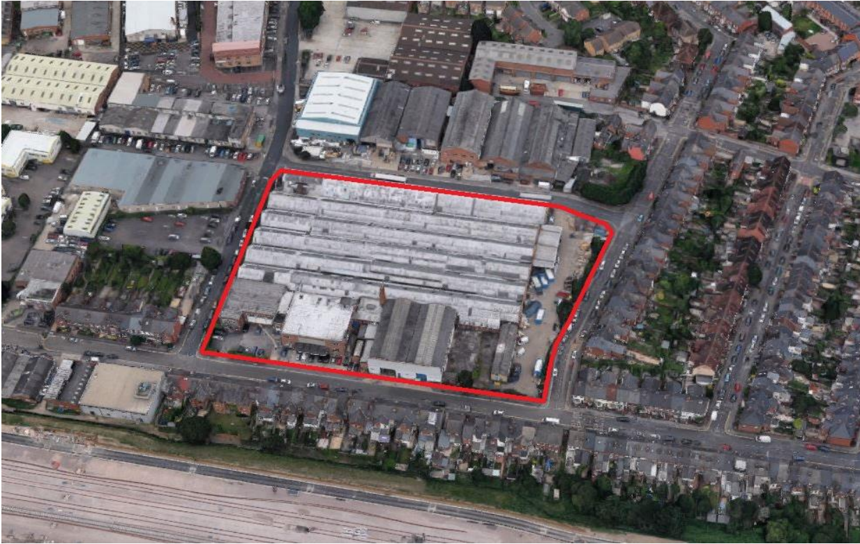
Aerial view of the property outlined in red