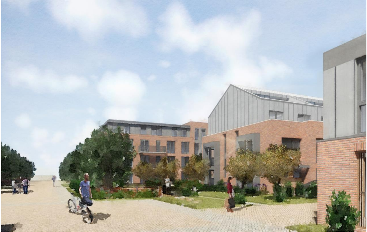
CGI image of the proposed development looking west