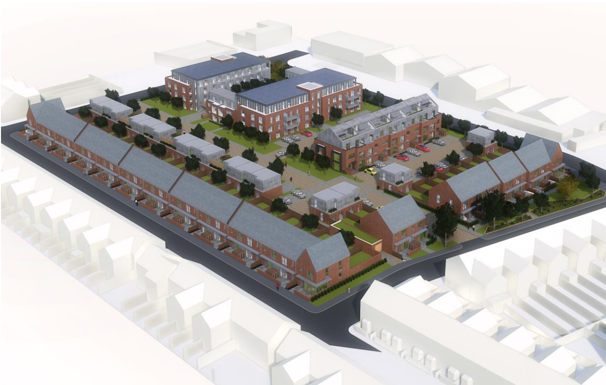
CGI image of the proposed development looking north west