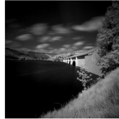
XVIII - Ashopton Viaduct, Peak District

May 2014 Zero Image 2000 Ilford Pan F Plus