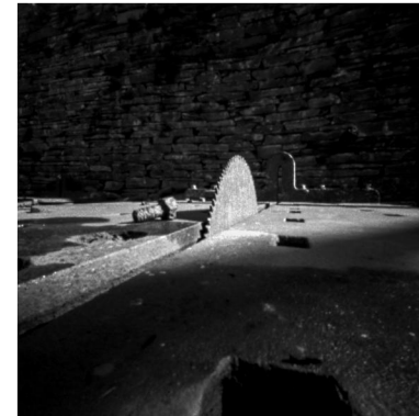
XX : Slate Cutting Saw, Australia Level, Dinorwic Quarries

April 2014 Zero Image 2000 Rollei 400 Infra Red