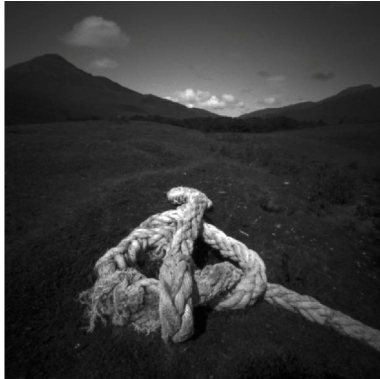
I : Loch Buie, Island of Mull