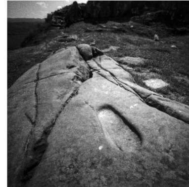
II: Dunadd, Argyll, Scotland

July 2013 Zero Image 2000 Ilford Pan F Plus