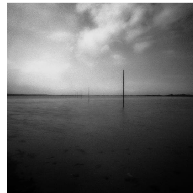
IV: St Cuthbert's Way, Holy Island, Northumberland

July 2013 Zero Image 2000 Ilford Pan F Plus