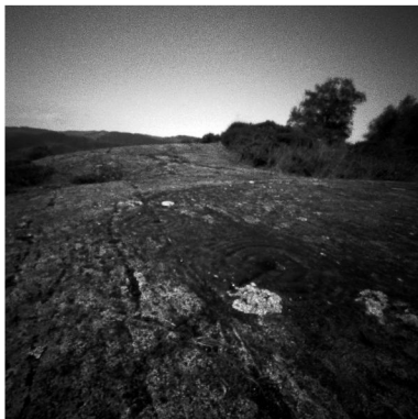
III: Cup and Ring Marks, Ach-nabreck , Argyll, Scotland

July 2013 Zero Image 2000 Ilford Pan F Plus