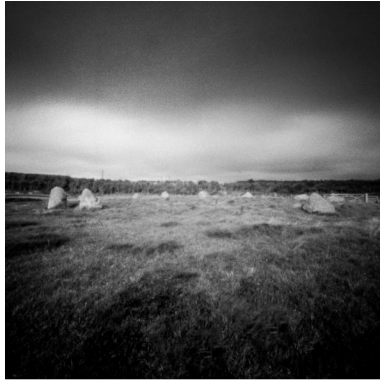
V: Greycroft Stone Circle Sellafield

Stone circle in the Shadow of the former Sellafield nuclear power plant.