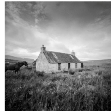
XXIV : Abandoned Croft, Staffin, Isle of Skye

May 2014 Zero Image 2000 Ilford Pan F Plus