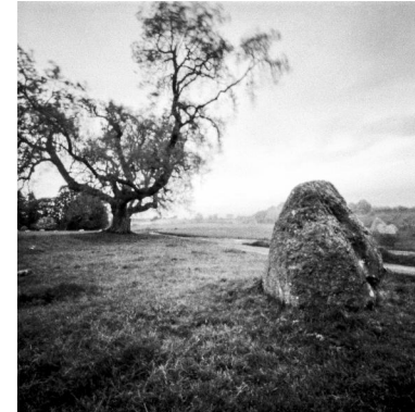
XXII : “A Daughter Lost”, Long Meg and Her Daughters Stone Circle, Cumbria

May 2014 Zero Image 2000 Ilford Pan F Plus