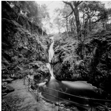
XIX : Aira Force, The Lake District

April 2014 Zero Image 2000 Ilford FP4 Plus