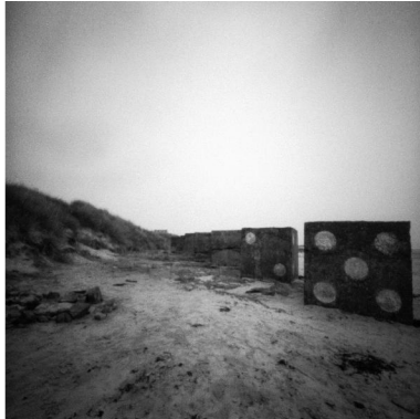
XXI : Tank Trap Dice, Bamburgh Beach, Northumberland

Tank traps provide shelter for a number of fires made by day trippers to this popular beach.