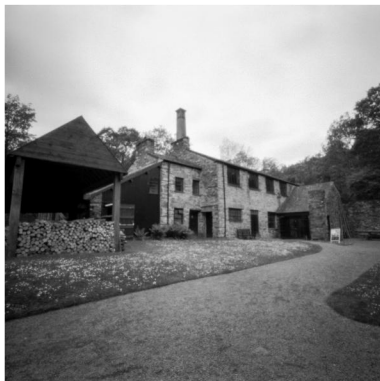
XXIII : Stott Park Bobbin Mill, Lake District

May 2014 Zero Image 2000 Ilford Pan F Plus