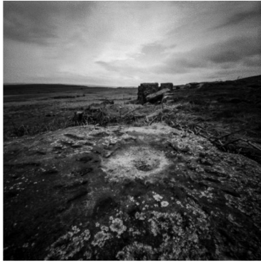
XVII : WW2 US Army Mortar Impact, Big Moor, Peak District

Impact crater near Neolithic burial mounds. Now a nature reserve.