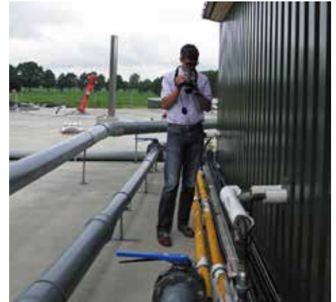
Explosion protected areas can be investigated from a safe distance with the FLIR GF320.

The decision to acquire the FLIR GF320 was relatively easy for IBS GmbH, because the camera has no real competition in terms of compact size and portability. The GF320 is also less expensive than competing thermal cameras. Finally, the GF320 detects not only methane, but a total of 20 gasses, including butane, propane, and benzene.