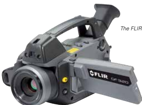
The FLIR GF320 thermal imager.

The key success factors for bioenergy facilities continue to be safety, efficiency and profitability. When carrying out gas detection, it is of vital importance that inspectors obtain as complete a picture as possible of the condition of a given plant. A FLIR infrared camera like the FLIR GF320 is an extremely important tool for tracking down potential gas leaks. The FLIR GF320 has certainly provided significant added value for IBS GmbH and its customers, ensuring optimized operation and safety.