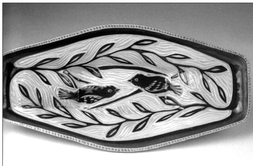
Fruit Bowl with Birds and Branches, Ruchika Madan

We first drove to the new farm that was being rented for the adults. My first impression was that it was entirely covered with wattle. In the pouring rain I could dimly see a small rambling narrow house in the distance. The sand had turned to slush and my little car slid along slowly in the general direction of the house. All the staff was there to welcome me into a rather large room that must have been intended to serve as a lounge cum dining-room. This was where the women worked round a big table. A narrow passage led from this room with a small kitchen and toilet on the one side and a single room that was being used as an office on the other. The passage itself led into another area that seemed to have been extended recently. The walls had not been plastered and on that day it looked particularly grey and miserable. This was the wood workshop in which there was an assortment of small light machine tools, a couple of tables and a workbench. On the far side a whole clutter of junk was stored. There was a door leading off to the backyard with a couple of corrugated iron shacks and a pit-drop toilet. I don't know what sort of setting I was expecting but this scene thoroughly depressed me. But with Veronica at my side, my gloom was not permitted to thrive. There