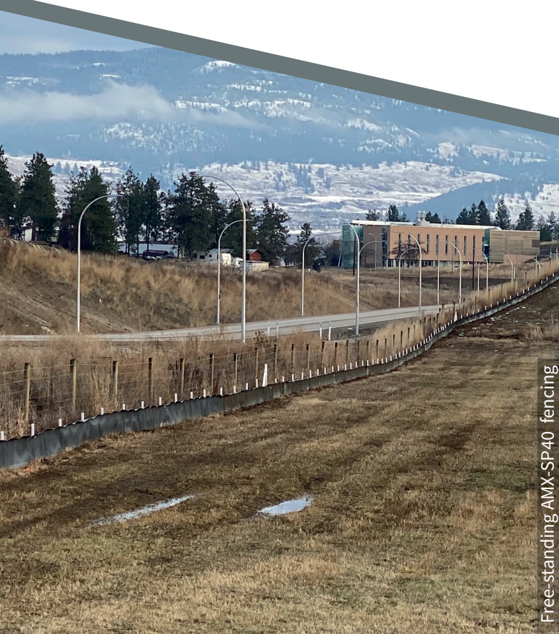
Free-standing AMX-SP40 fencing

821 N 27th St, PMB #289 Billings, MT 59101