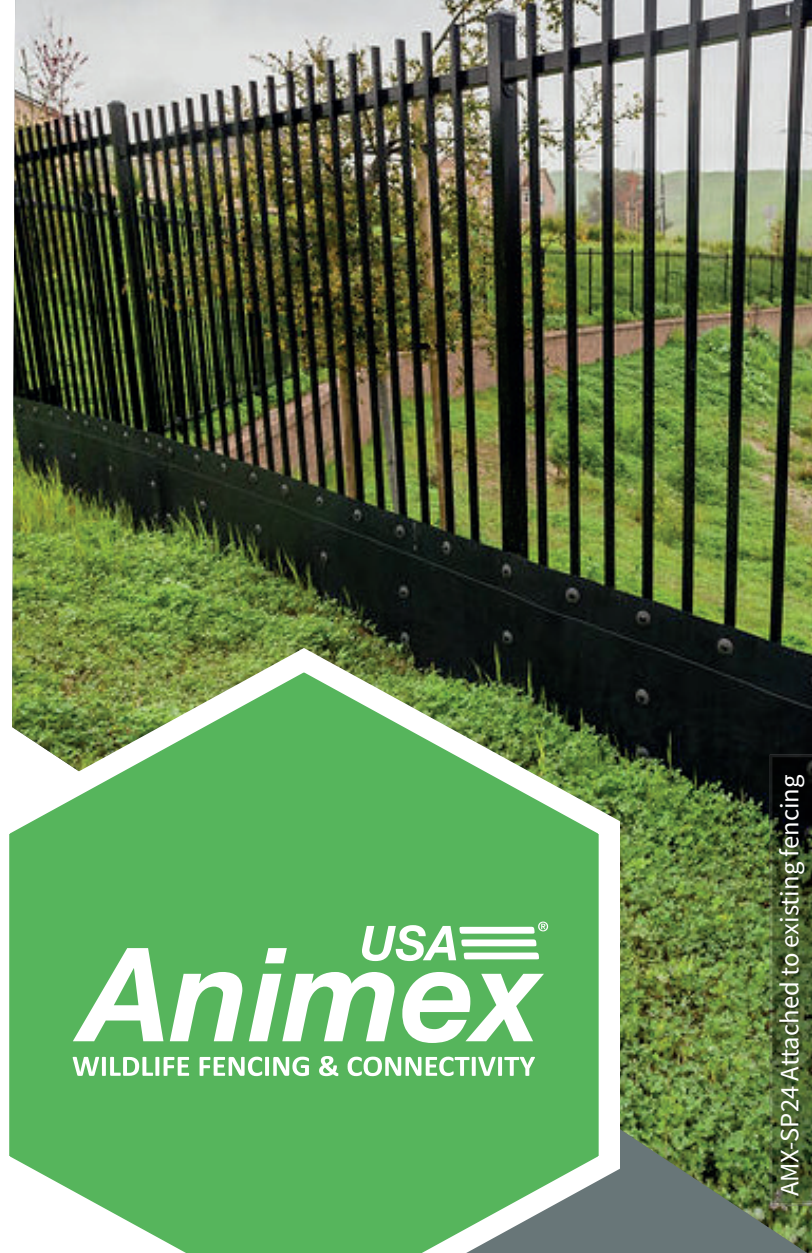
AMX-SP24 Attached to existing fencing

We are committed to reducing wildlife mortality and the restoration of fragmented wildlife habitats.