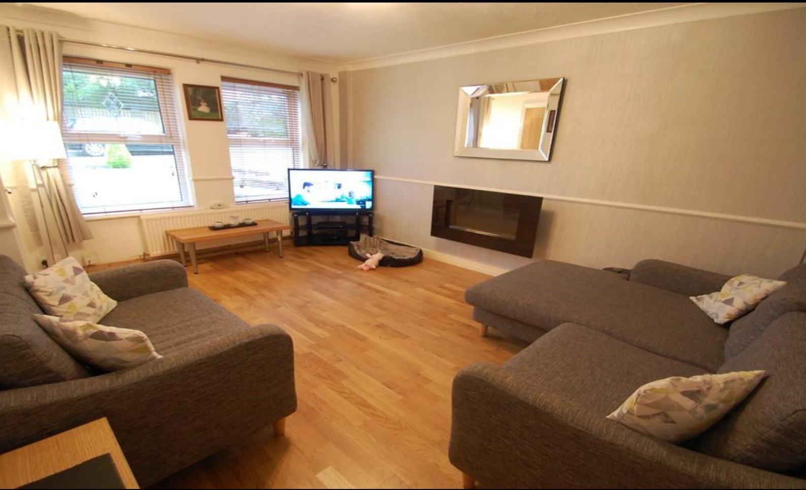
Merchants Landing, Lower Audley, Blackburn, BB1 1BU