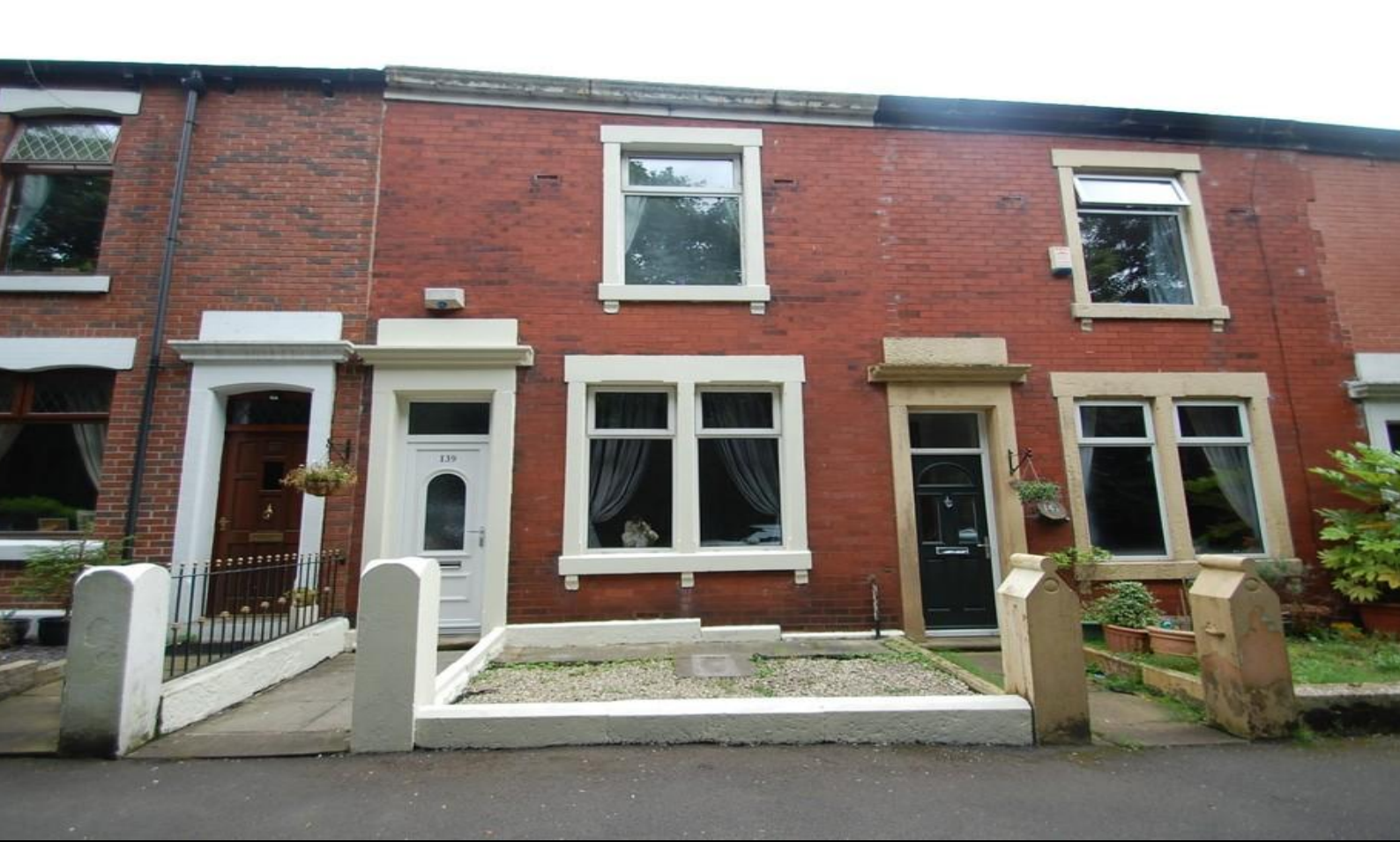
Selborne Street, Redlam, Blackburn, BB2 2SW