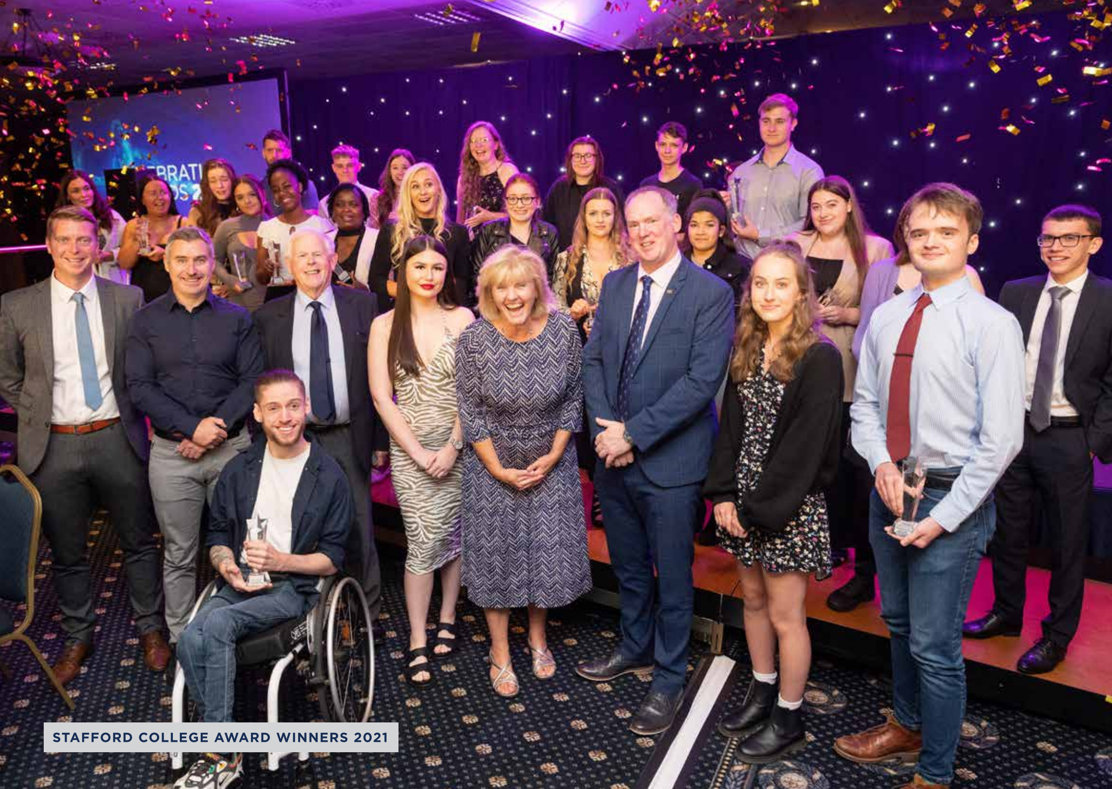
STAFFORD COLLEGE AWARD WINNERS 2021