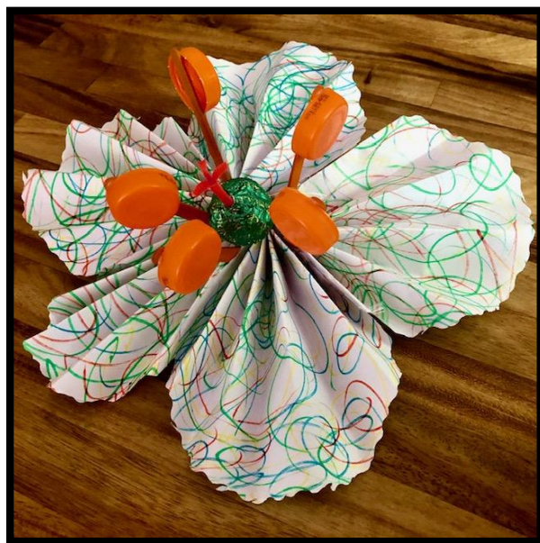
Made with foil, a straw, lolly sticks and bottle tops.