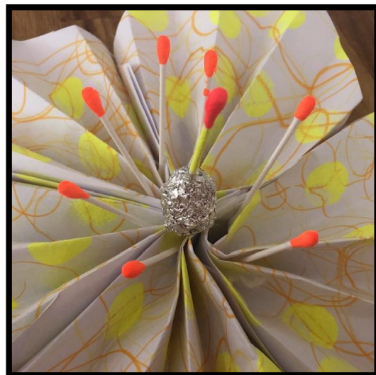
Made using cotton buds and foil. (This method was the easiest.)