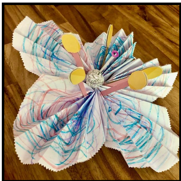
Made using foil, a bubble wand and cardboard.