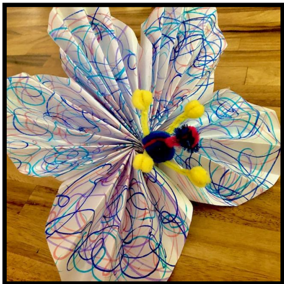
Made using pipe cleaners and pompoms.

Exactly how you construct the parts inside your flower is completely up to you and will depend on what you can find in your house. You will need to make one carpel and several stamens. Here are some pictures to give you a few ideas.