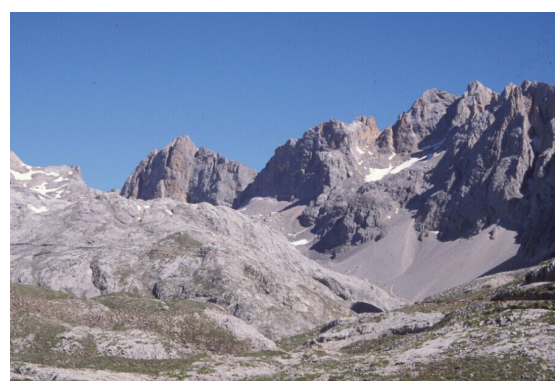
Alpine habitat in the Picos de Europa, north Spain.

The environment becomes increasingly harsh as one climbs a mountain. Above a certain altitude, it is so cold, wind-swept and snow-covered that trees cannot survive . This level is the 'tree line'. Above it the terrain is rocky and craggy (as above).