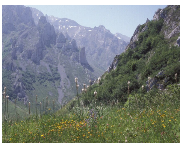
Alpine habitat in the Picos de Europa, north Spain.

They are amongst the most inhospitable habitats in which plants grow.