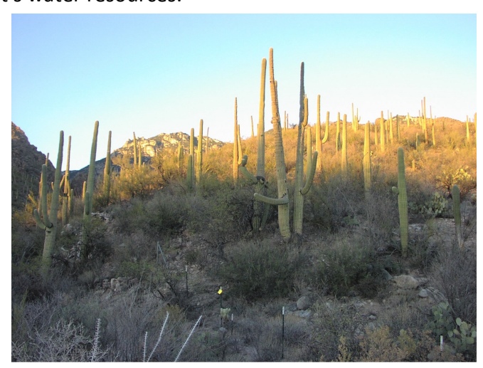
Slow growing Saguaro cacti and thorny scrub are the main components of the relatively diverse vegetation of the Sonoran Desert, Arizoha, USA.

In cacti and many other succulents, the method of photosynthesis is either by CAM or C4 pathway . Both processes conserve the plant's water resources.