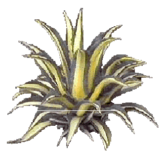
Agave is a leaf succulent