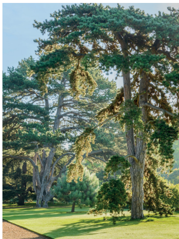
Two of the black pine trees on the Main Walk. John Stevens Henslow, Professor of Botany, used them to show variation within species.