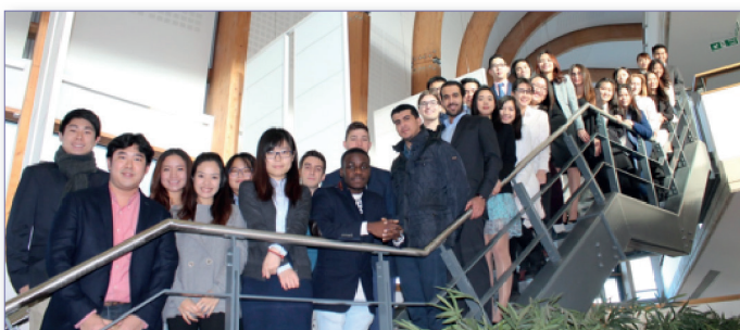
Entrepreneurship Masters classes 2014-2015

In September 2014, we welcomed our first students on the new MSc Entrepreneurship and Financing. This adds to our established MSc Entrepreneurship and Management programme and is a collaboration with the world-renowned ICMA Centre. This new programme provides specialist training in entrepreneurial finance, and is particularly helpful for those students interested in future careers in venture capital, or who come from family firms and want to improve access to sources of finance. Prospective undergraduates have been applying for our new BA Entrepreneurship and Management and BA Entrepreneurship programmes in the past few months. We look forward to welcoming the successful entrants in September 2015.