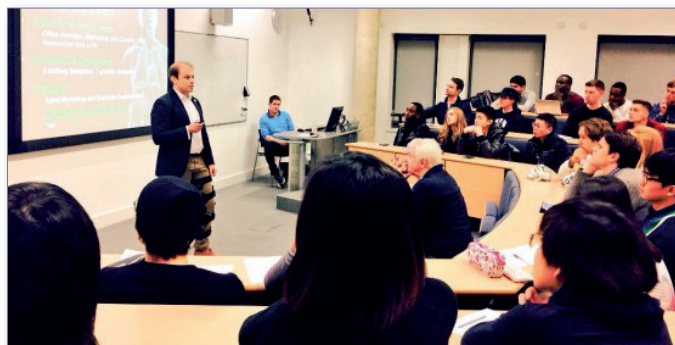
Careers in Entrepreneurship Workshop