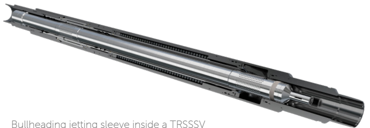
Bullheading jetting sleeve inside a TRSSSV

"a time-saving, effective scale removal tool"