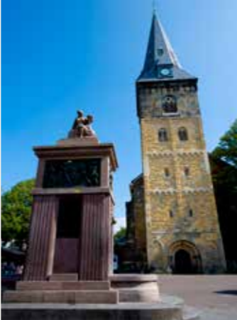
BRANDMONUMENT AND GROTE KERK

Enschede has a wide variety of catering establishments on offer, ranging from bars to cafés to restaurants. The Oude Markt forms the heart to all this and is considered one of the most welcoming terraces in the region. Surrounding the Grote Kerk are several venues, and multiple events take place at the square throughout the year.