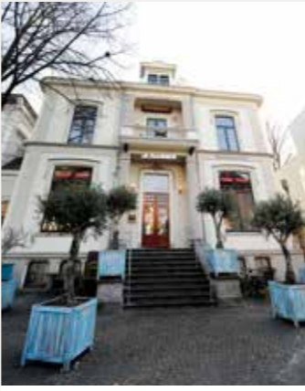
HOUSE WITH THE STEPS