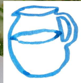
Jug of Water