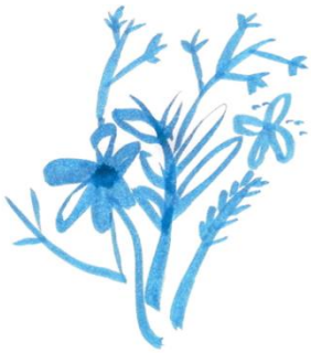
Flowers & Weeds