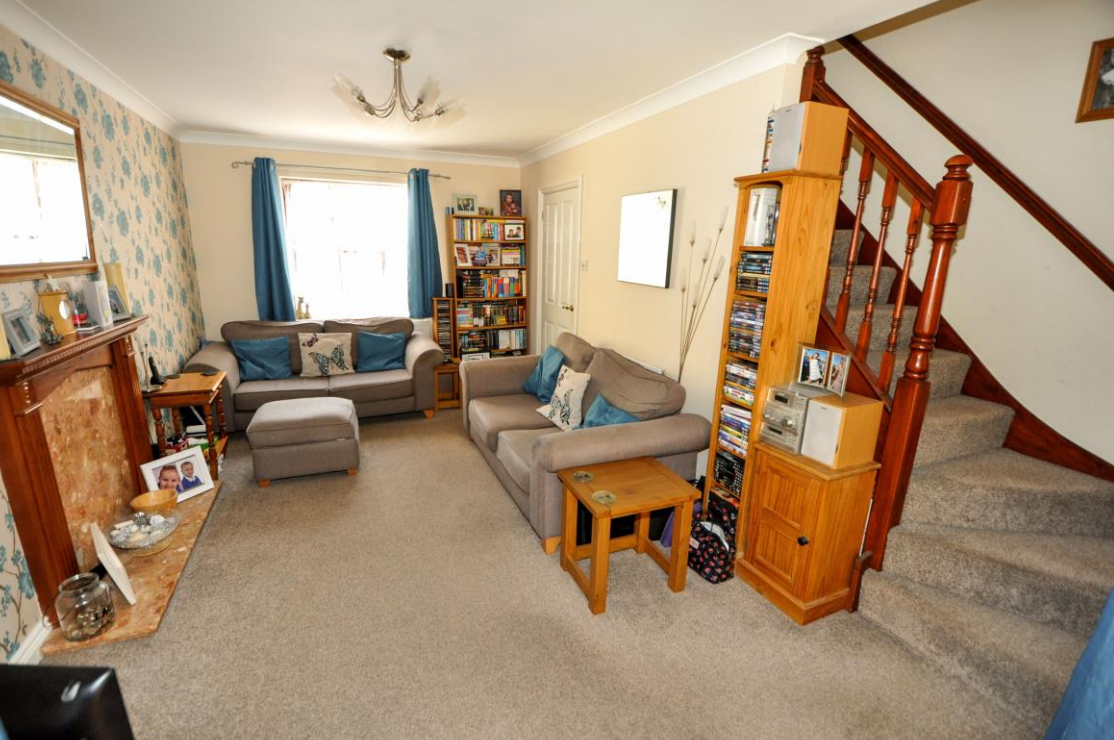
The Seller's View "A spacious family home in a quiet cul de sac close to all amenities"