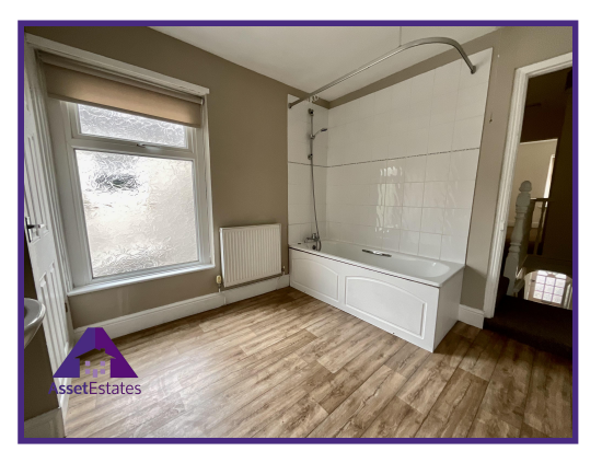
Gladstone Street, Abertillery, NP13 1NE