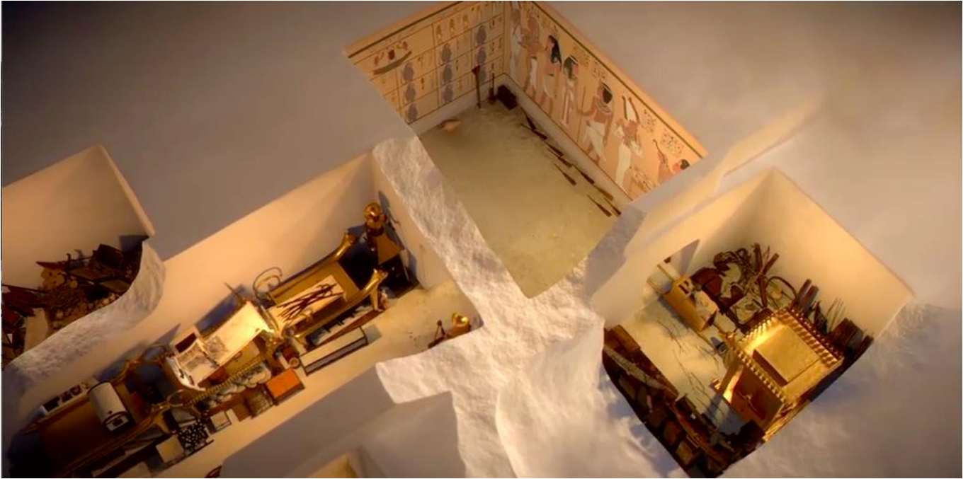
CGI from King Tut documentary Similar CGIs will be produced for the Treasure of the Sacred Bulls

Egypt: The Treasure of The Sacred Bulls is a 90 and 52-minute documentary that tells both the story of an exceptional archaeological excavation conducted by the Louvre museum team in the present and the story of the adventure initiated in the mid-19 th century by one of the fathers of modern archaeology and Egyptology, Auguste Mariette. Furthermore, it's a tale depicting the strange religious traditions practiced in ancient times under the reigns of the pharaohs: the incarnation of a preeminent divinity of the Egyptian pantheon into a sacred animal; the process required to select the young bull; the worshipping rites performed within the great temple of Ptah; the procession along the avenue bordered with sphinxes when taking the animal's mortal remains to their final resting place within the necropolis; as well as the throngs of pilgrims depositing offerings and inscribed tablets by the animal's sarcophagus. A lost world that the scientists will once again bring to life through their investigational field work.