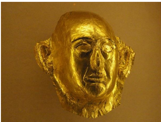
Jewel from the prince Khaemwaset grave