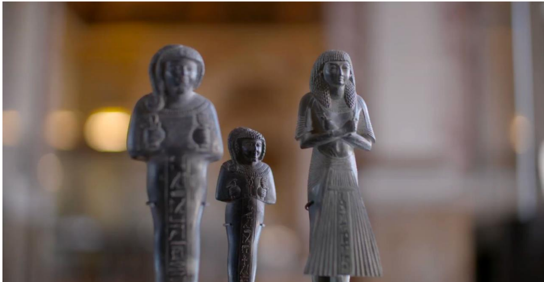
Usheptis found by Mariette in the underground gallery where the excavation will take place.

But that wasn't all: at the entrance of the galleries obstructed by the rubble (which prevented the continuance of the excavation work), Mariette unearthed the remains of the treasure of Ramses II's son, Khaemwaset (who is deemed the founder of the necropolis), including precious artifacts such as jewelry or a golden mortuary mask, today on display at the Louvre museum. Although the necropolis of the Serapeum is dedicated to the sacred animal, such discoveries show that finding other objects beyond those reserved for the cult of Apis can be expected when exploring the monument, among which in particular possible remains from private individuals' gravesites.