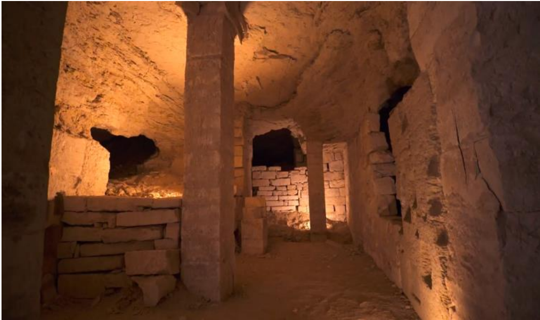
The gallery where the excavation will take place.

What kind of objects do the archaeologists expect to find under the rubble of the unexplored galleries, approximately five meters beneath the ground? To surmise what may be there, one needs to refer to what is characteristically involved in the Apis bull cult. An incarnation on earth of the god Ptah – the divinity that shapes the world – the Apis bull was unique: there was only one per generation.