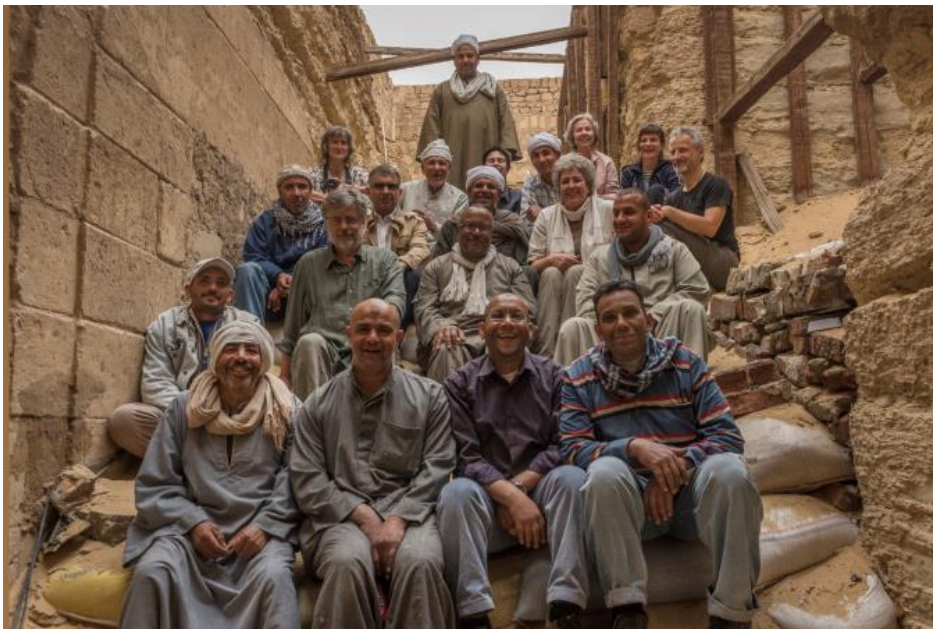
The excavation team

It is likely that the site expands beyond what Mariette indicated, and especially that there are further unexplored levels below, under the inventoried galleries. How can we make that assumption? With a simple calculation: we know that the Serapeum was built upon the initiative of Khaemwaset, son of Ramses II, circa 1220 B.C.; we also know that the necropolis was active during the Ptolemaic period (that is to say the very beginning of the Christian era) and that all the Apis bulls were buried there; and we know that only the parts corresponding to the last centuries of ancient Egyptian history were explored by Auguste Mariette. Consequently, 800 years of activity remain to be discovered and excavated – and if we consider that the life-span of a bull is approximately 30 years, the population buried there must have been particularly significant !