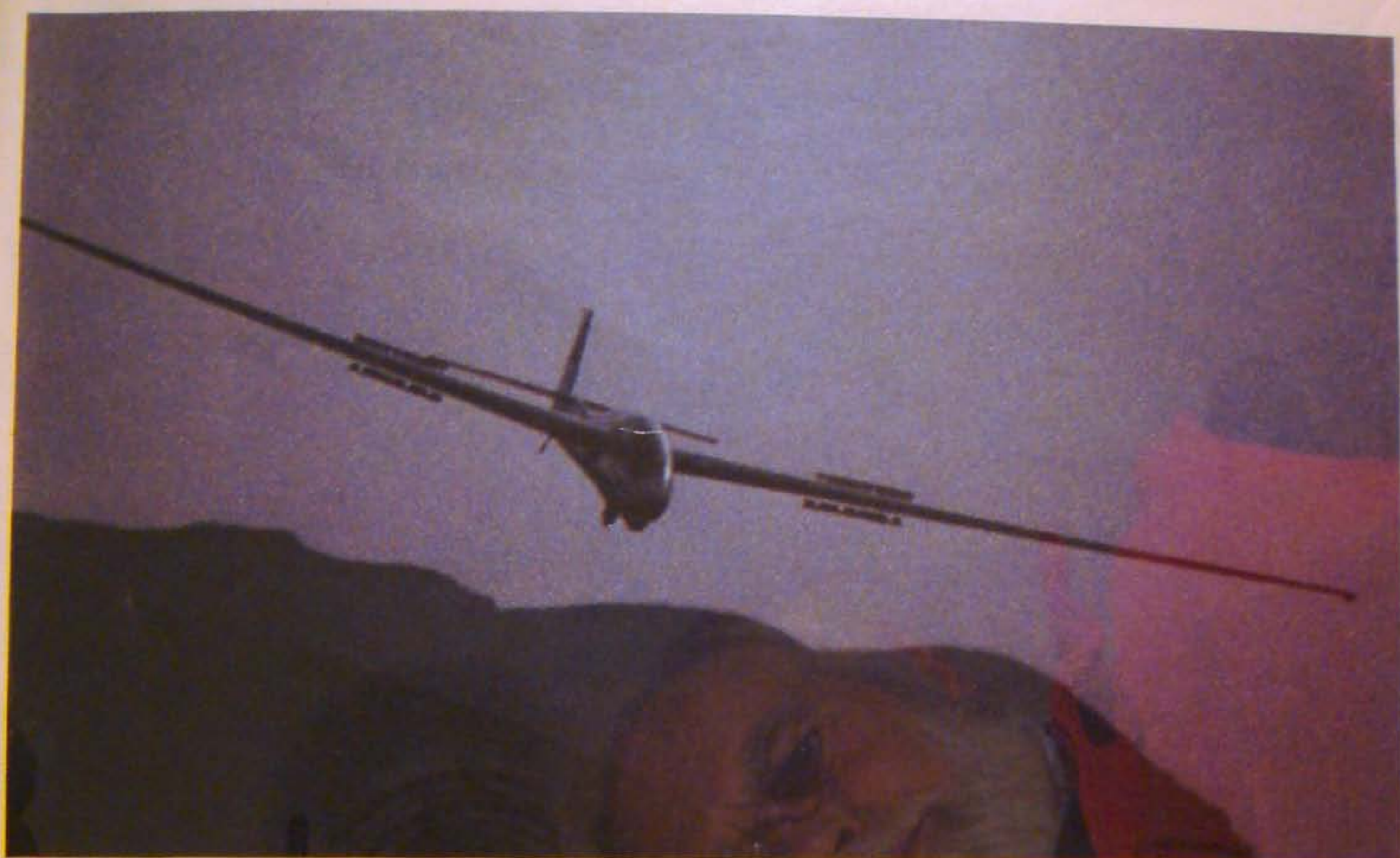
A twin-seater Bocian glider with its air brakes fully open prepares to land at Portmoak airfield in Scotland, possibly the most beautiful gliding site in Britain

slang) at Leuchars on the east coast of Scotland, dressed in the one-piece overall of the modern fighter pilot, waiting for the call which will send him howling out over the North Sea in his Phantom to intercept any suspicious foreign aircraft that may turn up - as they do regularly in that part of the world.