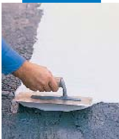
Trowelling on Aquaflex