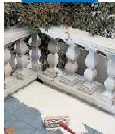
Using a roller to apply Aquaflex