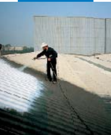
Spraying Aquaflex onto corrugated asbestos cement after treating with Primer for Aquaflex