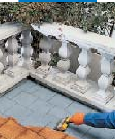
Applying Primer for Aquaflex