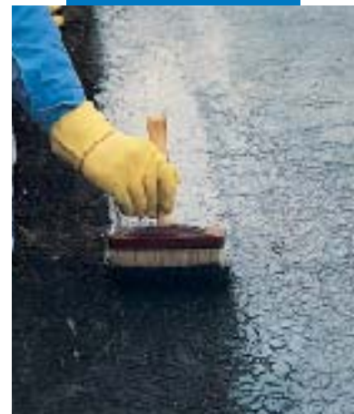
Applying Primer for Aquaflex over an existing asphalt membrane