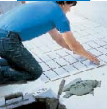
A terrace waterproofed with Aquaflex and covered with ceramic tiles