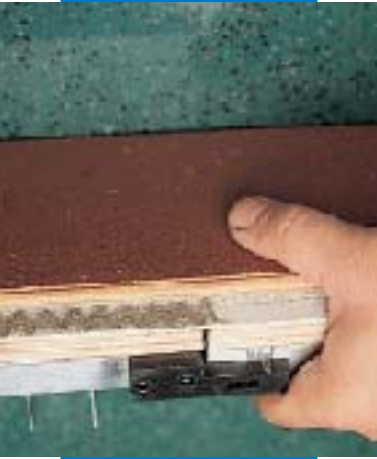
Anti-fracture test of Aquaflex