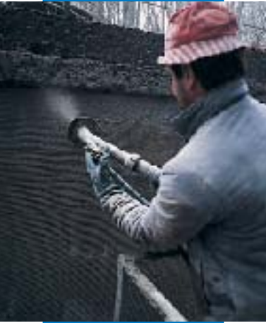
Bertini hydroelectric canal - Robbiate (Como) - Italy: spray application

All relevant references of the product are available upon request