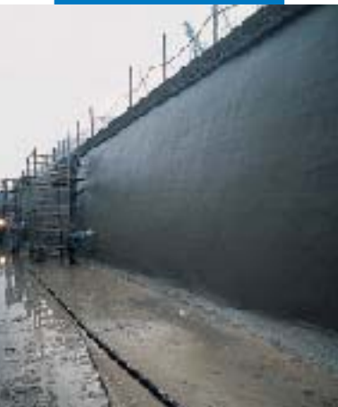
Bertini hydroelectric canal - Robbiate (Como) - Italy: General view