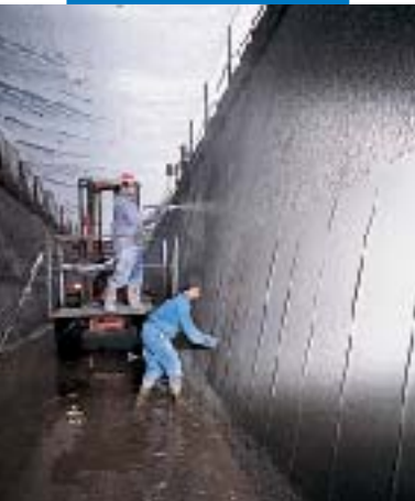
Bertini hydroelectric canal - Robbiate (Como) - Italy: finishing with a trowel