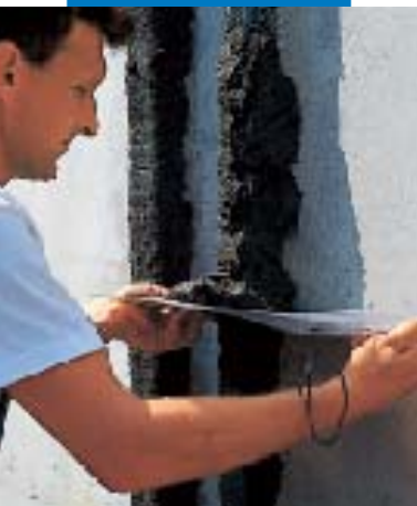
Shaping the screed