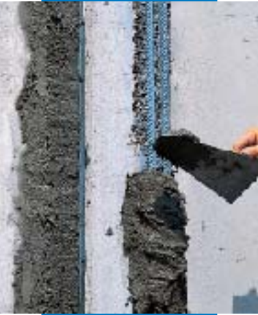
Application with trowel

Contains cement. We remind you that the cement in contact with sweat or other body fluids produces an irritant alkaline reaction and allergic reactions to those predisposed.