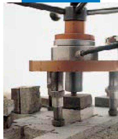
SATTEC adhesion test