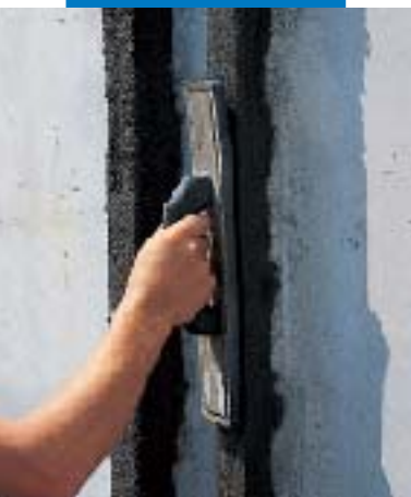
Finishing with a sponge float