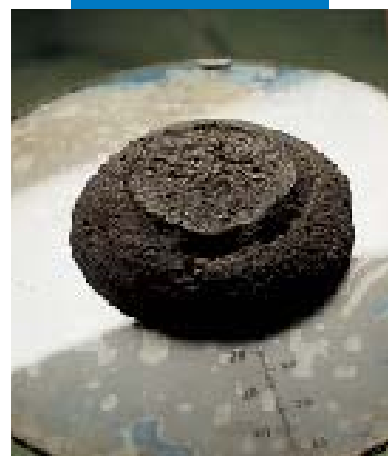
Flow test (UNI 7044/72 norm)