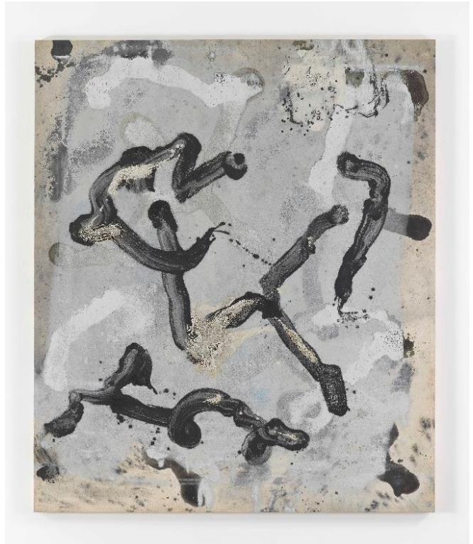
Ed Moses, In Space What's Up , 1988 Courtesy the Estate of Ed Moses and Blain|Southern Photo: Prudence Cuming

Private View: Thursday 18 July 2019, 6-8pm