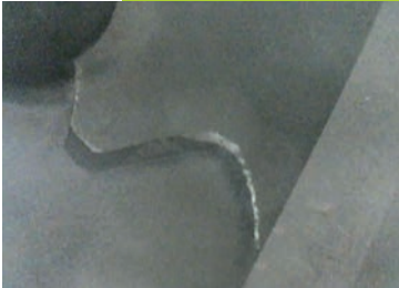
Breakage detected thanks to E.A.SY. SKITE

A Stralis came to the repair centre, with the customer complaining about problems of jerking when starting. The most common causes can be play on the propeller shaft or clutch. However, unless you're really sure about it, the clutch should be left until last because the job involves removing the entire gearbox. The mechanic gets to work with an E.A.SY.SKITE. And one of the longest, most complicated checks has been made easy: 30 minutes to inspect the clutch pressure plate, to discover that it is actually broken. Without E.A.SY.SKITE, the dealer would have taken 7 hours!