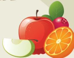
Fresh Fruit فواكهة طازجه