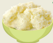
Mashed Potatoes البطاطا المهروسه Safari Fries also available البطاطس المقلية و الشيبسي متوفره