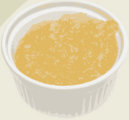
Apple Sauce صلصه التفاح