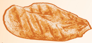
Grilled Chicken قطعه دجاج مشوي