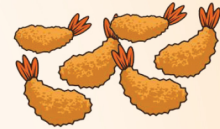
Poppin' Shrimp Popcorn shrimp جمبري مقلي