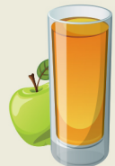
Apple Juice عصير تفاح

Pepsi® Products also available يوجد مياه غازيه من بيبسي