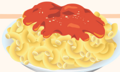
Python Pasta Served with your choice of Alfredo, Butter or Marinara sauce المكرونه مع اختيارك من صلصه الفريبدو او الذبدة او صلصه المارينارا