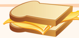
Gorilla Grilled Cheese Delight American cheese on Texas toast ساندوتش جبن امريكي