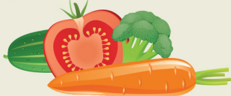
Steamed Veggies خضار علي البخار