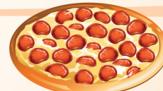
Castaway Kid's Pizza Cheese or Pepperoni بيتزا مع اختيارك من الجبن او قطع اللحم البقري