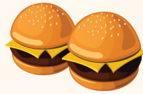
Rainforest Rascals™ Char-grilled mini burgers ساندوتش برجر