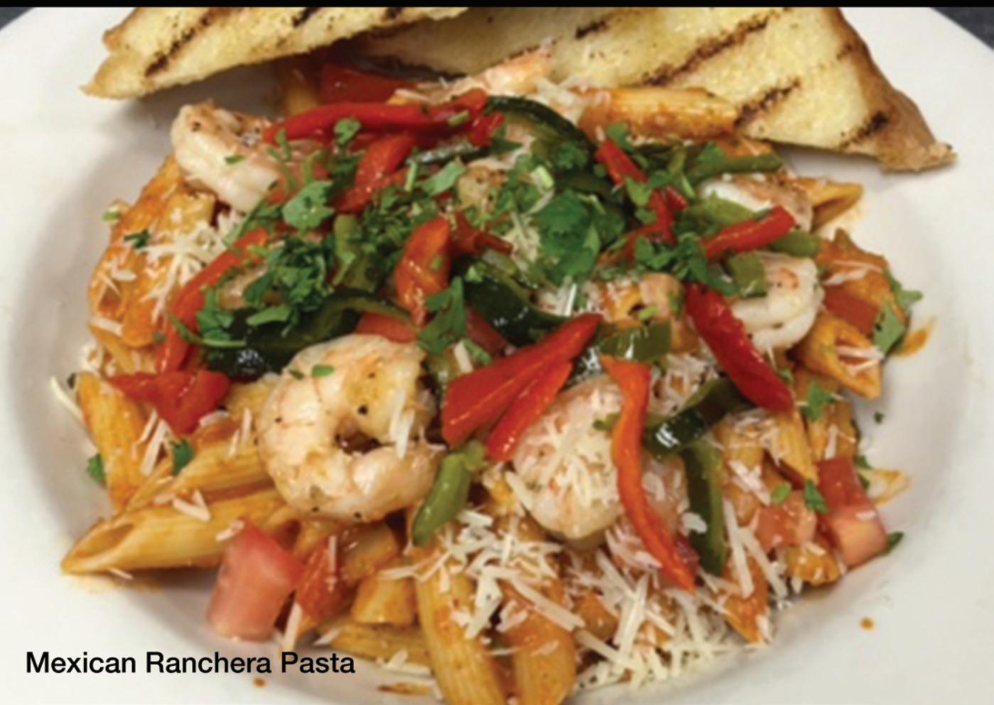
Mexican Ranchera Pasta