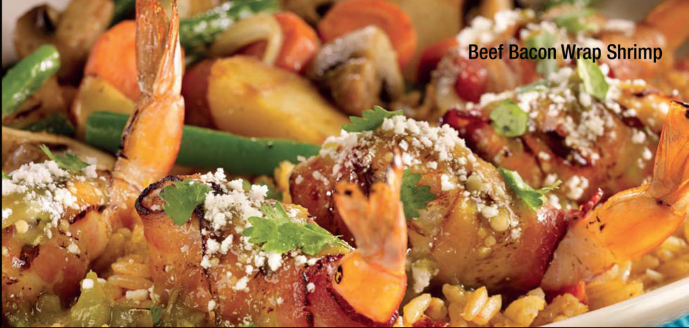
Beef Bacon Wrap Shrimp