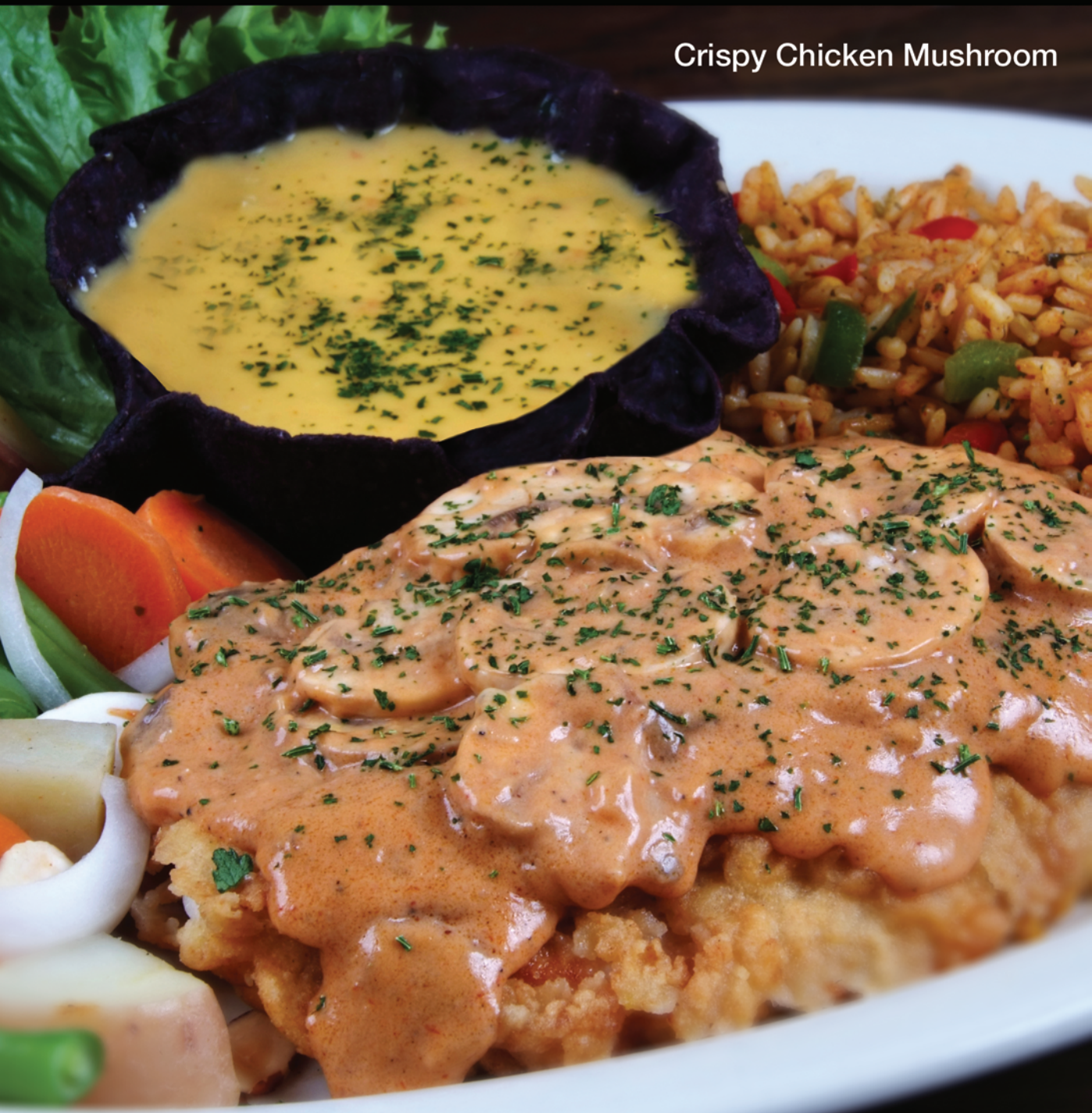
Crispy Chicken Mushroom

Grilled breast topped with sauteed shrimp. Served with rice and sauteed vegetables.