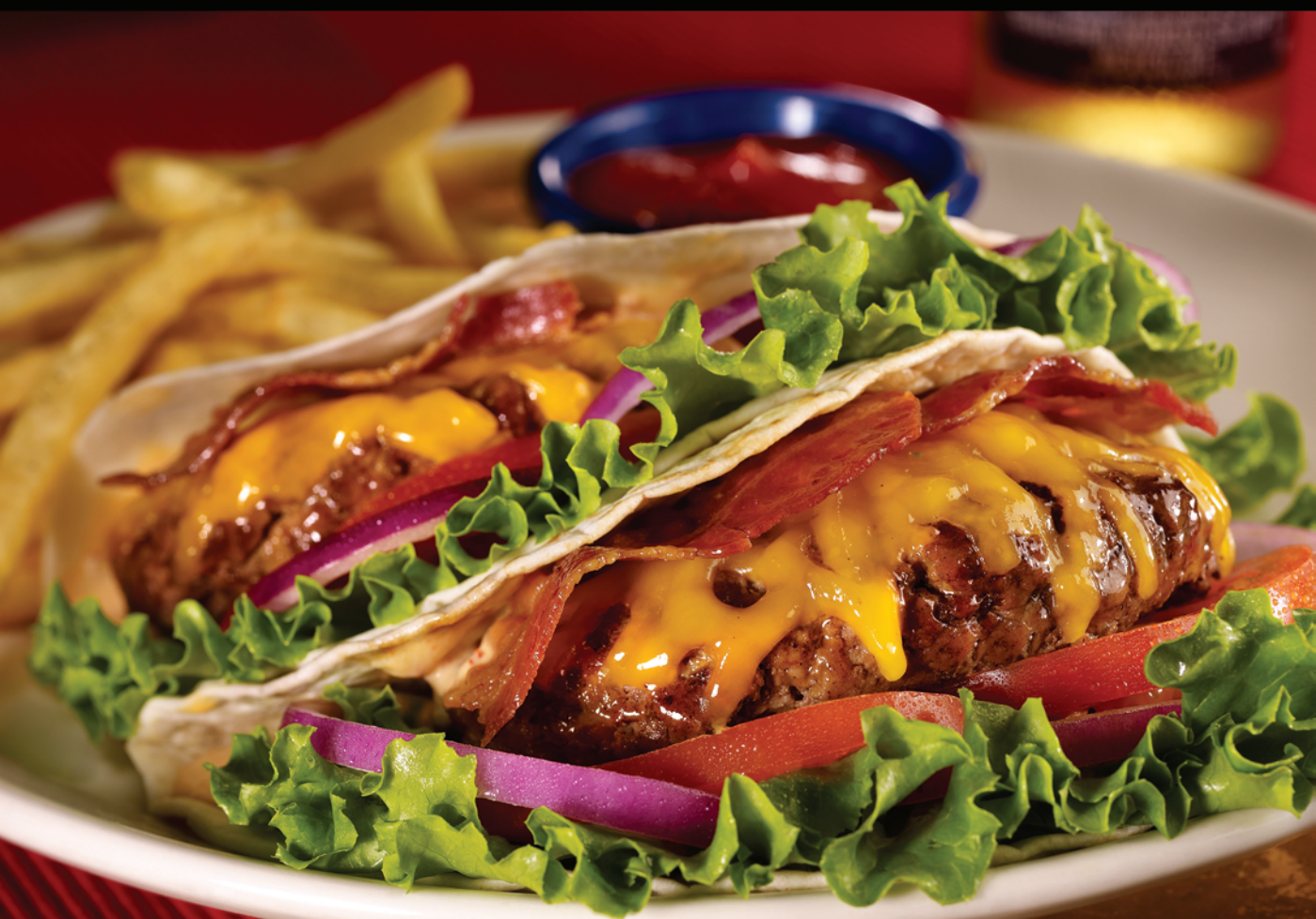
Beef Bacon Cheese Burger Taco