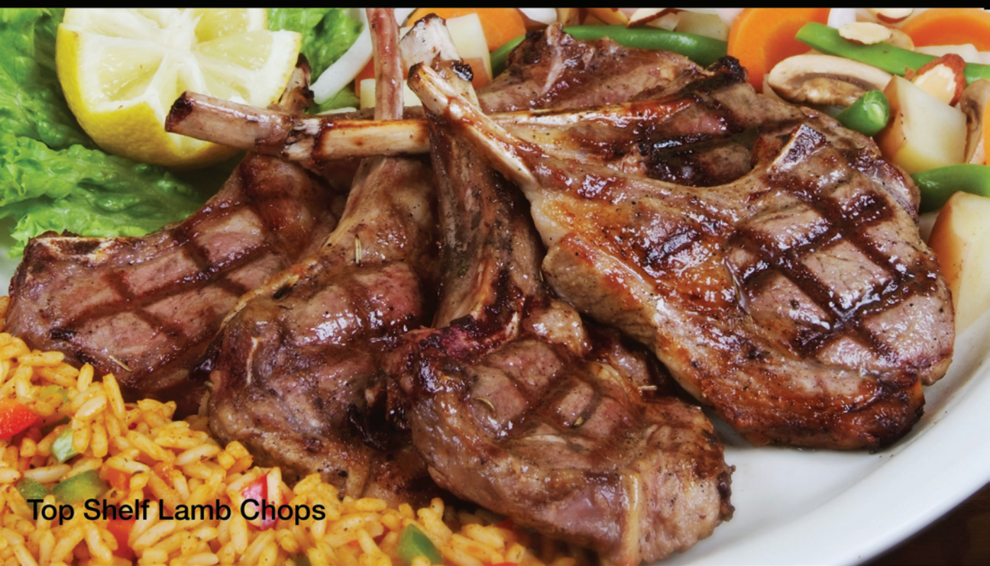
Top Shelf Lamb Chops