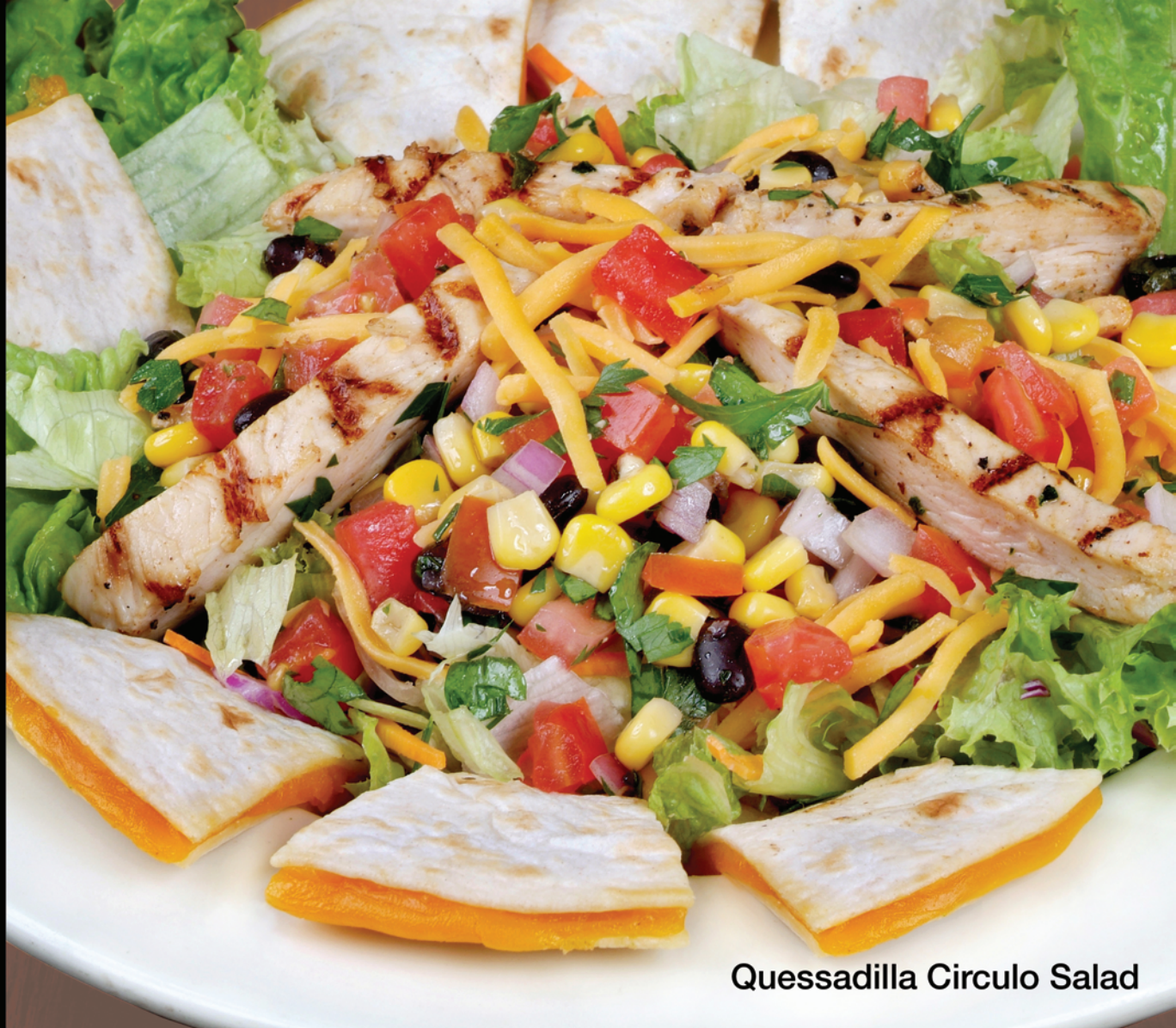
Quessadilla Circulo Salad