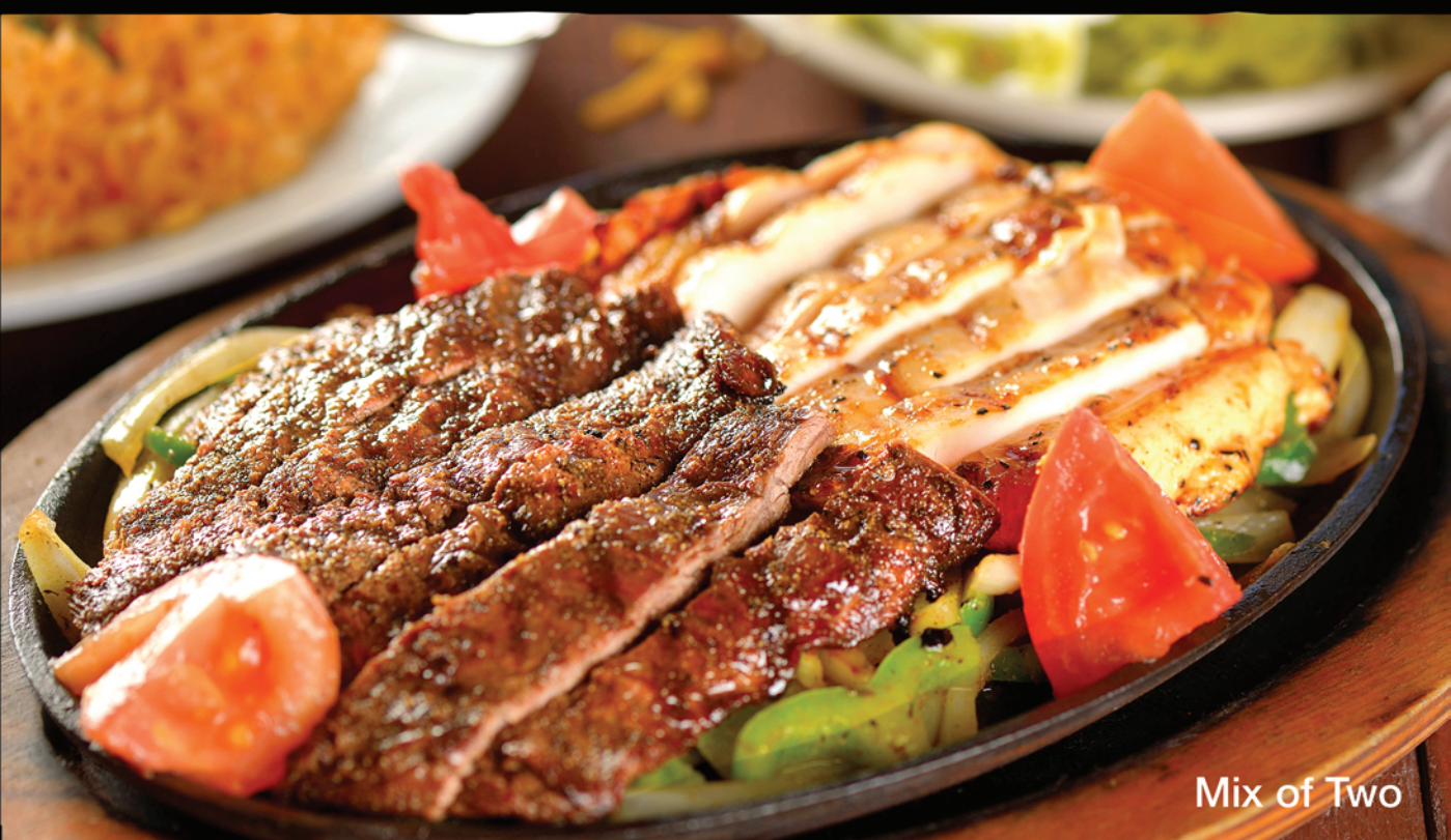
Mix of Two