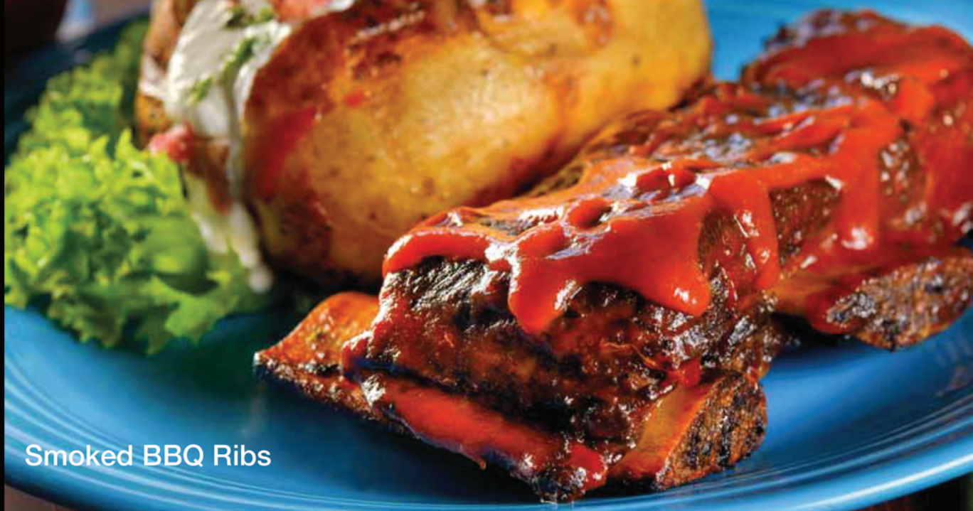
Smoked BBQ Ribs