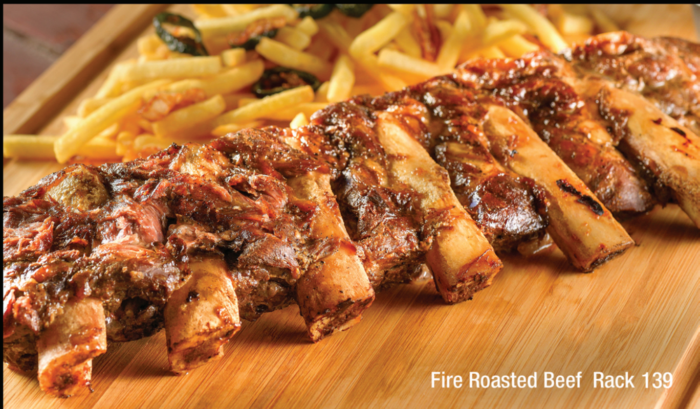
Fire Roasted Beef Rack 139

*NOTICED: MAY BE COOKED TO ORDER, CONSUMING RAW OR UNDERCOOKED MEATS, POULTRY, SEAFOOD, SHELLFISH OR EGGS MAY INCREASE YOUR RISK OF FOOD BORNE ILLNESS, ESPECIALLY IF YOU HAVE CERTAIN MEDICAL CONDITIONS.