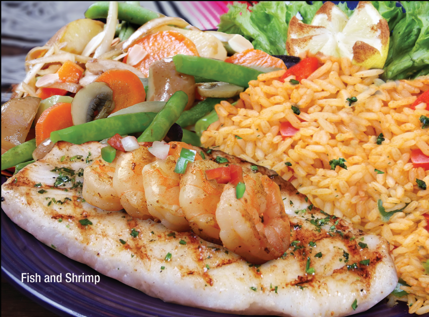
Fish and Shrimp

Shrimp stuffed with jalapeno and jack cheese, wrapped with beefbacon then grilled, topped with verde sauce and cojita cheese. Served on a bed of rice with sauteed vegetables.