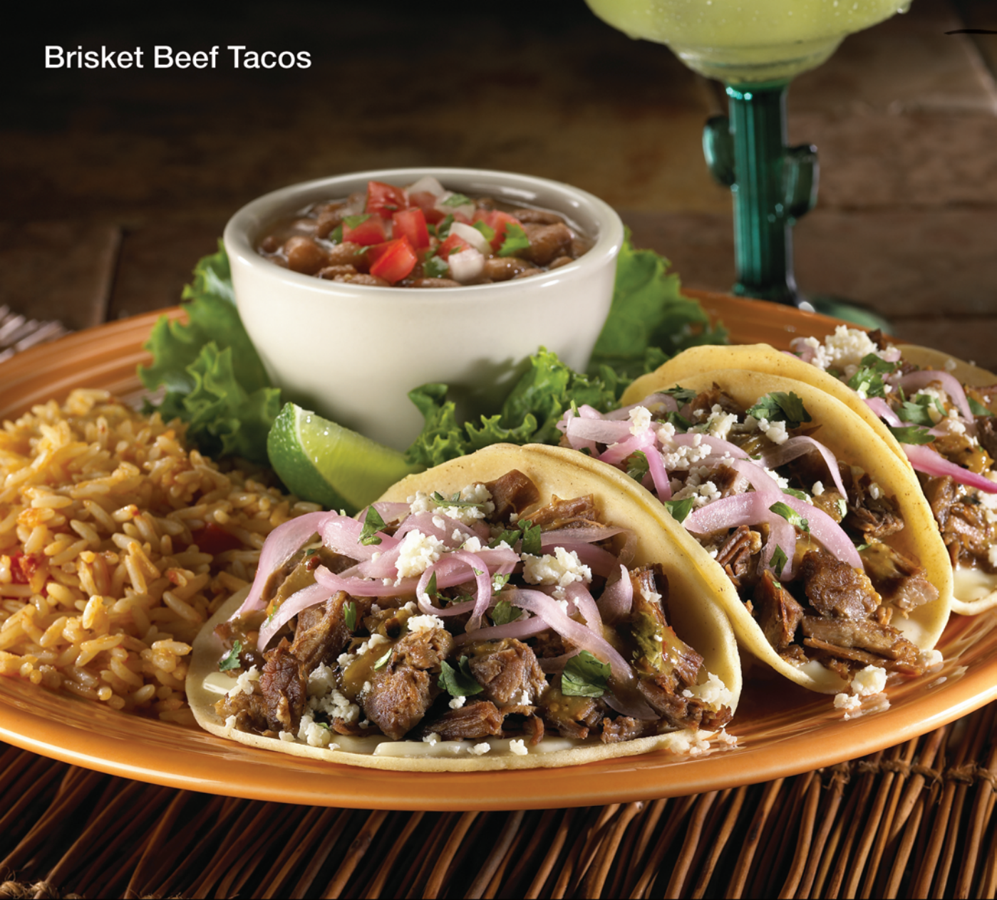
Brisket Beef Tacos