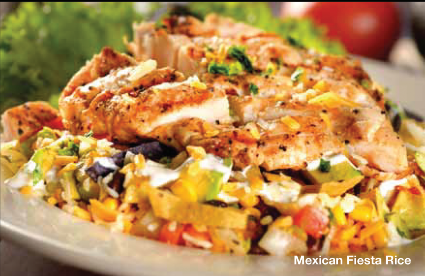
Mexican Fiesta Rice

Fajita chicken, chipotle cream sauce, rice and frijoles rancheros in a flour tortilla. Toppes with sour cram sauce, cheddar and tomatoes. Served with diablo corn and rice.