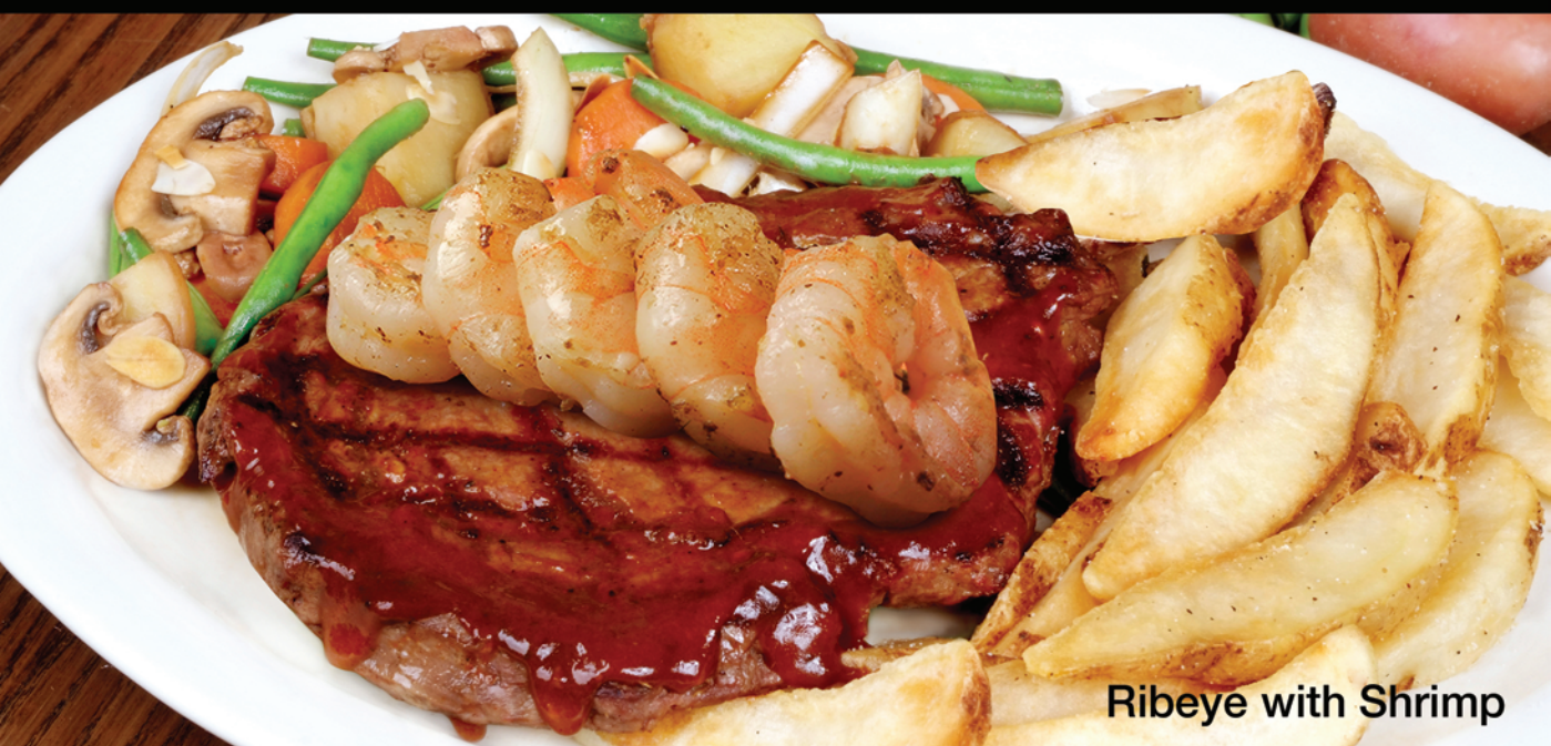
Ribeye with Shrimp