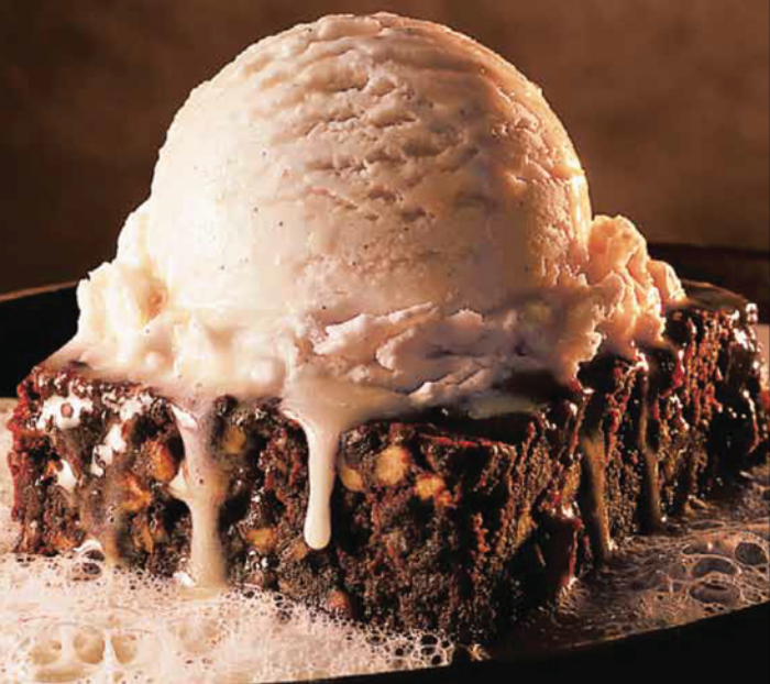
Brownie Skillet Sudaes 42