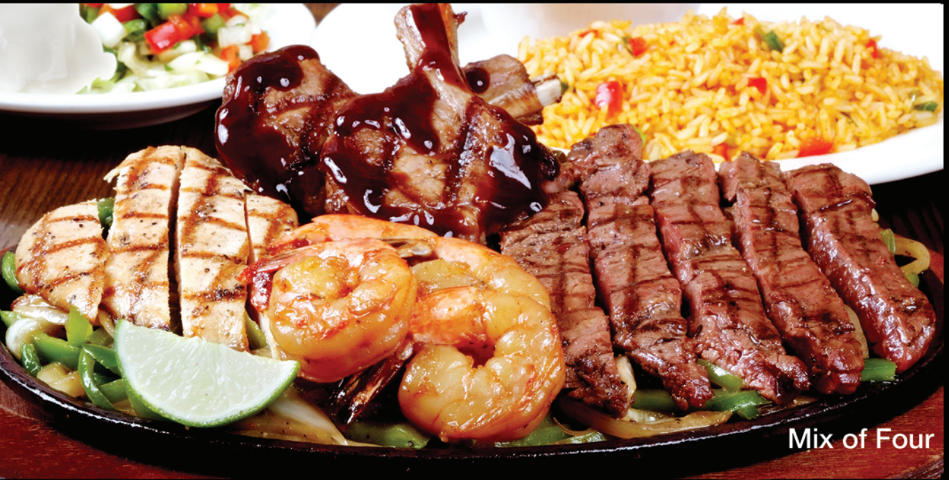
Mix of Four

All our fajita are served with flour tortillas, grilled onions and peppers, tomatoes, rice, frijoles rancheros, pico de gallo, sour cream, guacamole and shredded cheddar cheese.