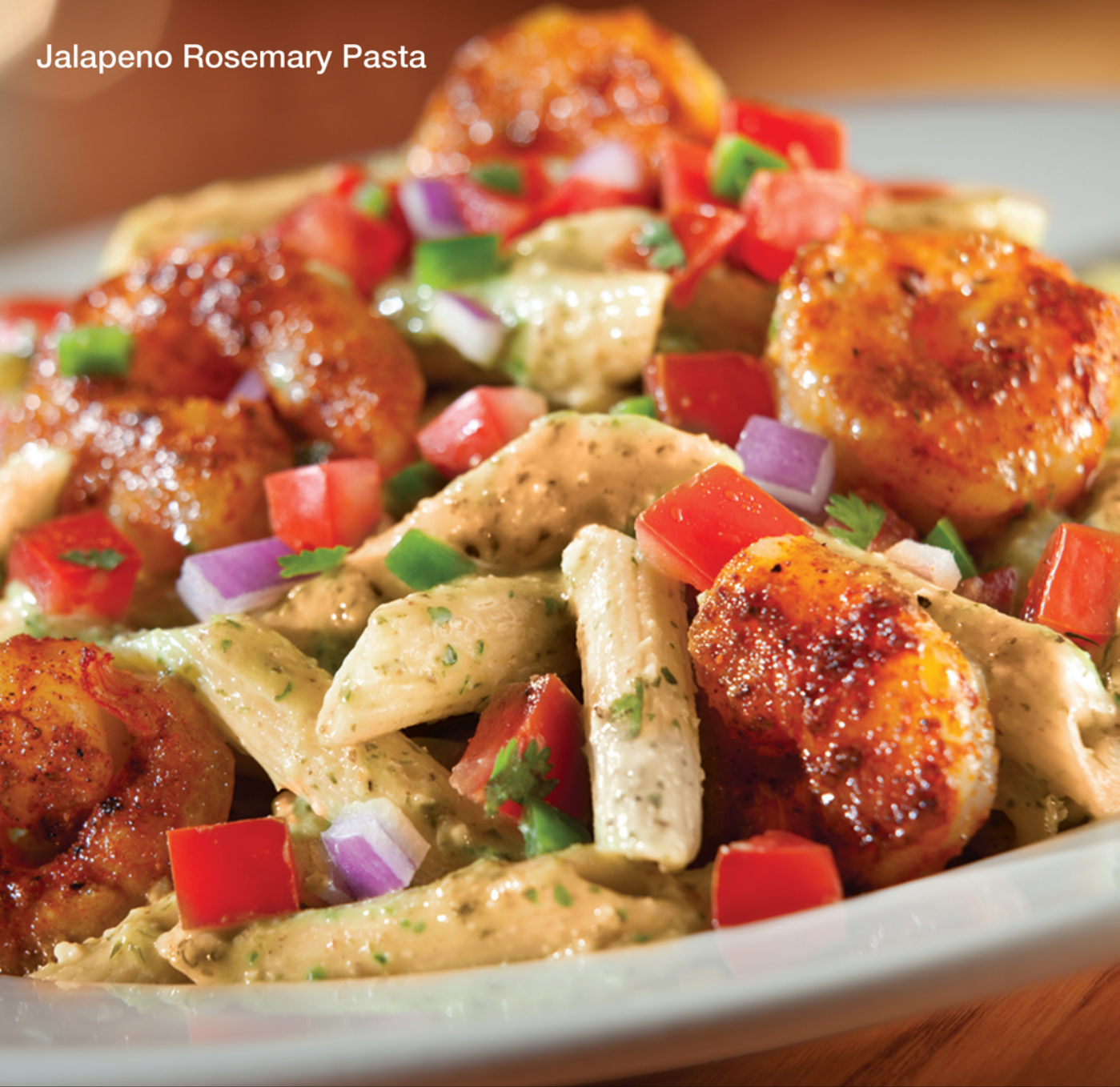
Jalapeno Rosemary Pasta