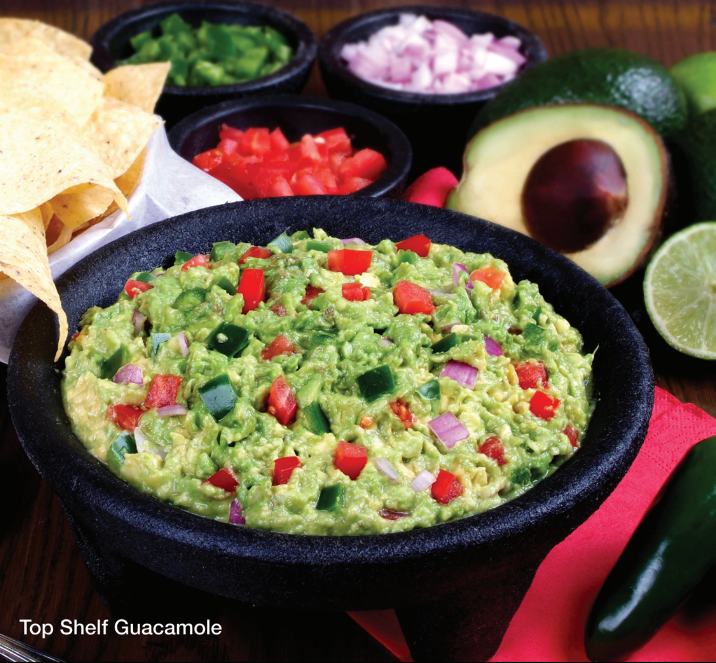
Top Shelf Guacamole