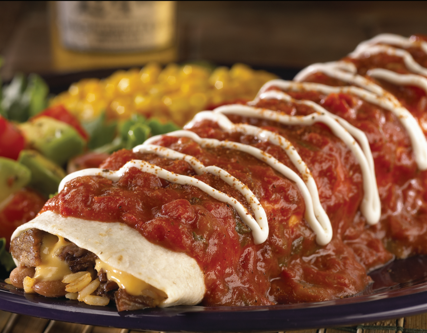
Grand Brisket Burrito