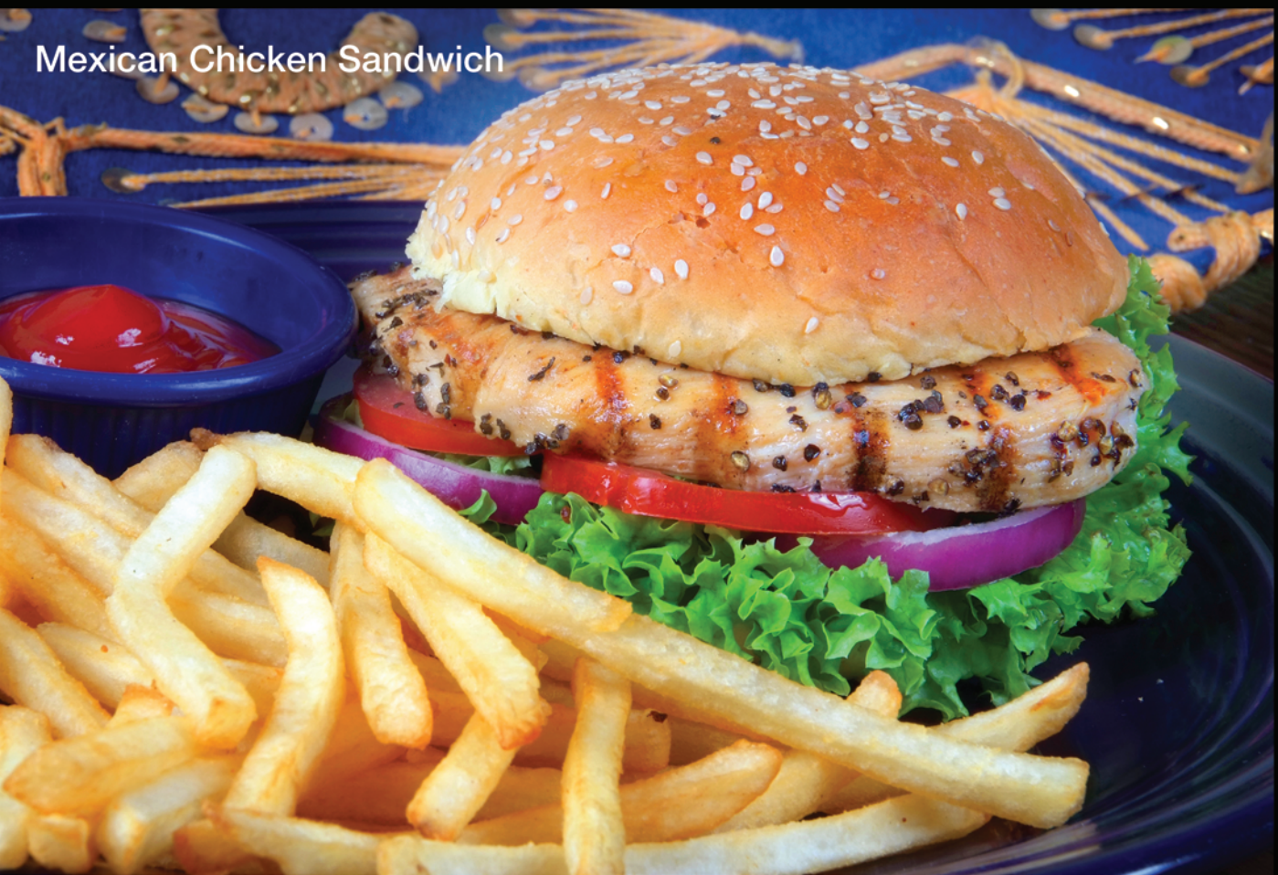
Mexican Chicken Sandwich