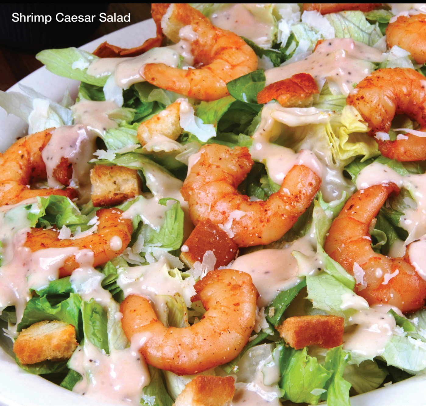
Shrimp Caesar Salad