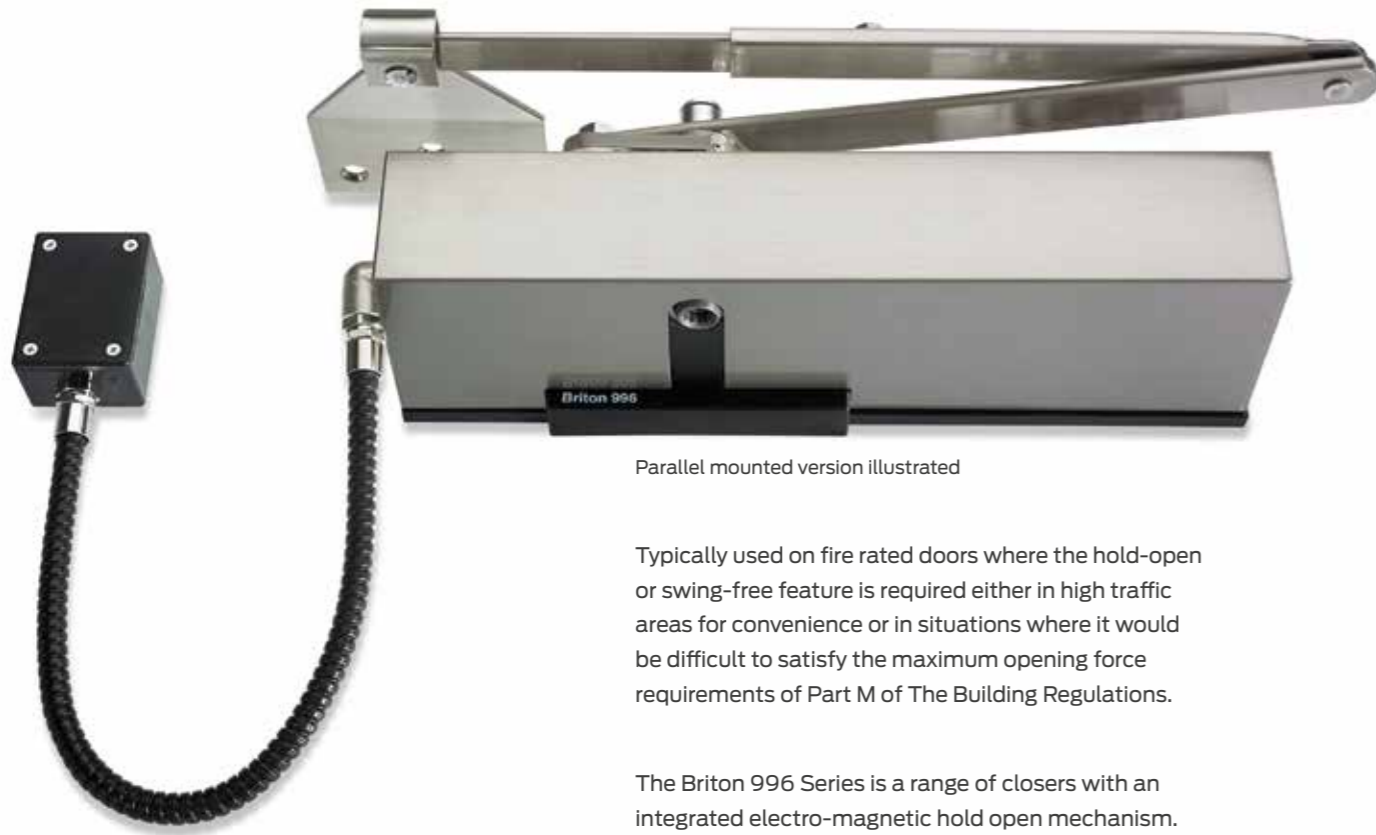
Parallel mounted version illustrated

Typically used on fire rated doors where the hold-open or swing-free feature is required either in high traffic areas for convenience or in situations where it would be difficult to satisfy the maximum opening force requirements of Part M of The Building Regulations.