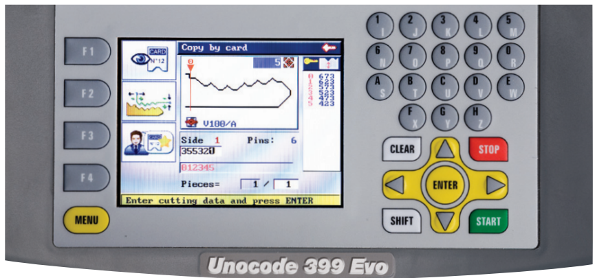
New user friendly key board

Code Maker cards downloading and transfer function; 1 USB port and 1 RS232 port connectivity; Automatic Calibration.