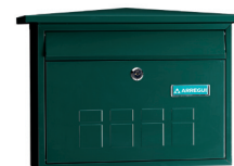
Green/ E-5703 * 157039