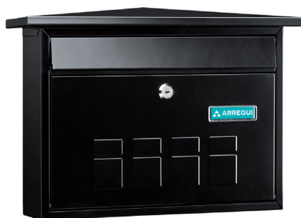
Black/ E-5704 * 157046