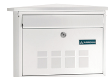
White/ E-5701 * 157015