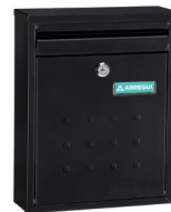
Black/ V-1324 * 113240