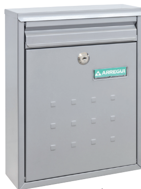
Silver/ V-1322 * 113226