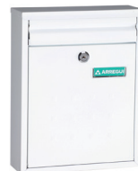
White/ V-1321 * 113219