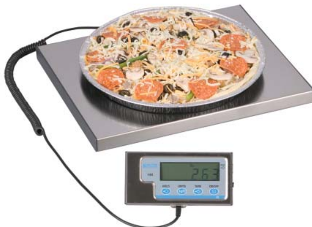
WS15 for use in portion control applications