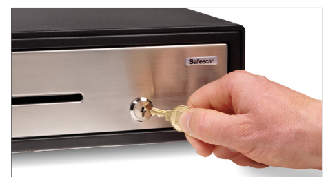
With 3-position lock (locked, stand-by and open)