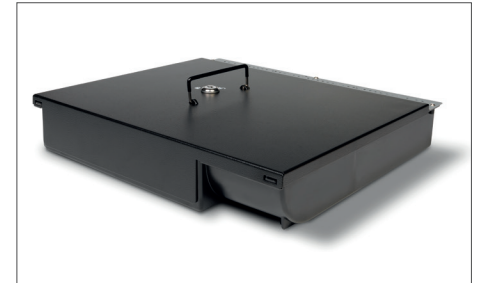
Safescan 4141L Lockable lid Art. no: 132-0432