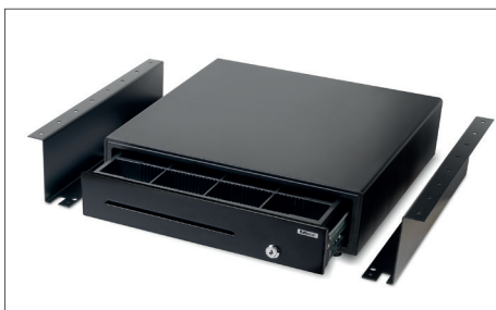
Safescan 4141B Mounting Bracket Art. no: 132-0436