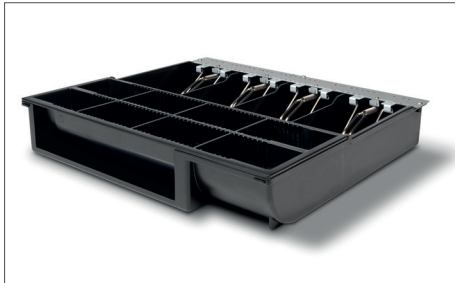
Safescan 4141T1 Cash drawer tray 4/8 Art. no: 132-0430