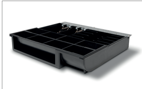
Safescan 4141T2 Cash drawer tray 6/8 Art. no: 132-0431