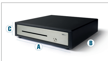
Dimensions: A: 41 cm - B: 41.5 cm - C: 11.5 cm