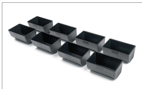
Safescan 4141CC Coin Cups Art. no: 132-0497