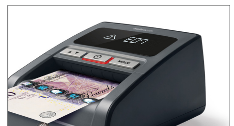
Suspected banknote alarm with visual and audio alert