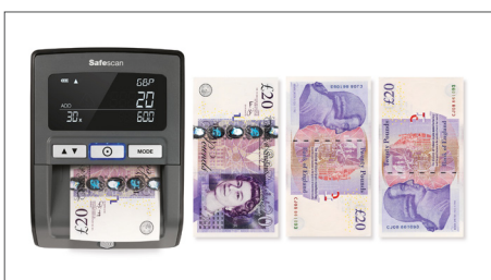
Insert British Pound banknotes in any direction