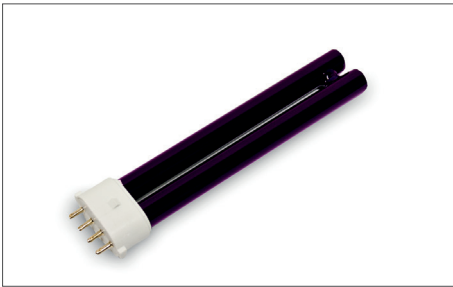
Safescan 50 / 70 UV tube Art. no: 131-0411