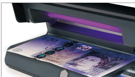
Ready for the new polymer banknotes