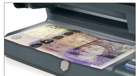
Large LED white light area to verify watermark, metallic thread and microprint