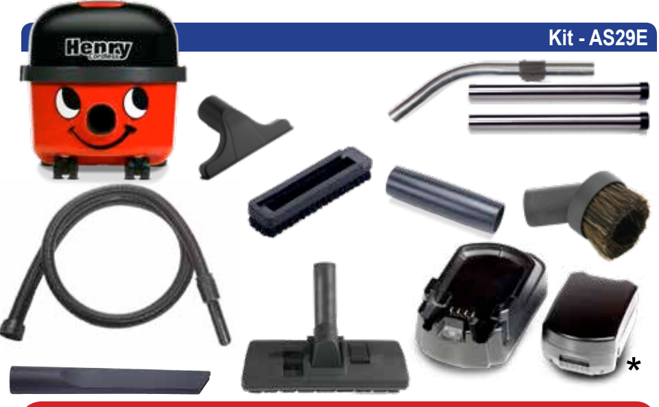
NOTE* Located in the bottom of your box is your Lithium-Ion Battery and charger