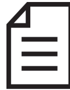
Declaration Of Conformity CE