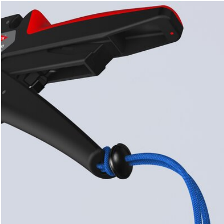
fastening device on the end of the handle (drop protection system)