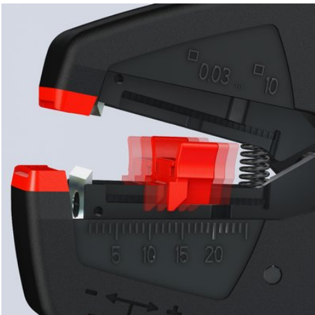
Adjustable length stop