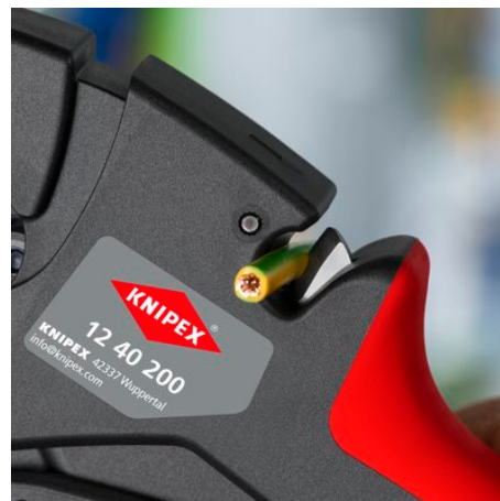
Integrierter Kabelschneider bis 10 mm 2 feindrchtig, 6mm 2 eindrchtig!