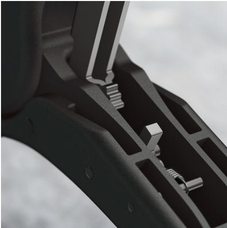
The positive lock always ensures the perfect contact pressure