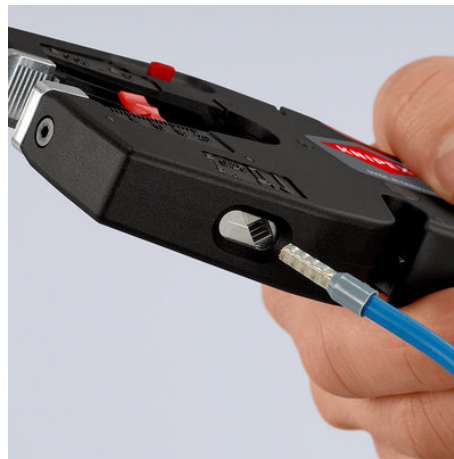
Square crimping point for wire end ferrules 0.25 - 4 mm²