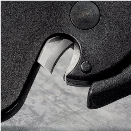
With cable cutter for conductors up to 10 mm 2