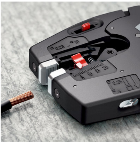
Automatic stripping up to 10 mm².