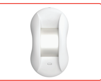
Curtain PIR Motion Sensor