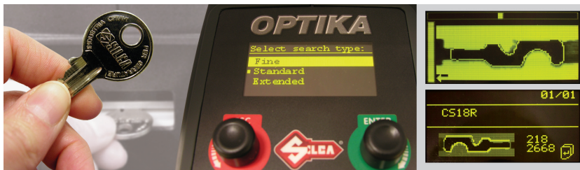
Key profile reading: you can choose fine, standard and extended mode

The operator can select the language from the following available: English, Italian, German, French, Spanish.