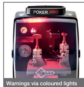
Warnings via coloured lights