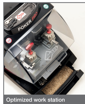
Optimized work station

Poker Pro is lightweight, portable and has a compact design. The ergonomic grip below the machine body makes it easy to lift and transport. The machine comes with a fixing bracket, the ideal solution for locksmiths working out of a van.