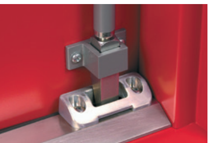
376MDS metal door strike

For vertical panic bolts. Comprises 2 strike plates and 1 trip plate to activate the top tripper.