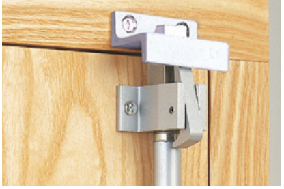
376FFKP - Flush face keeper plate

Suitable for doors that require the push bar to be in a lower position e.g schools. It can also be used on doors up to 3350mm high.