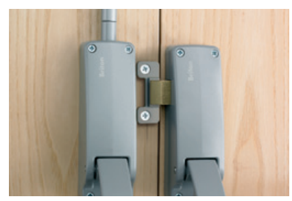
378DDS - Double door strike

For applications where there is a flush head frame a flush face keeper plate can be used to secure the bolt.