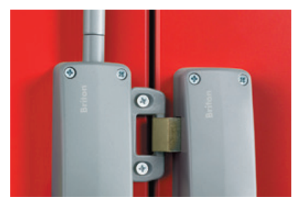
378MDS metal door strike

for use with Briton 378 rim devices on single doors, or on the first opening leaf of a double rebated application.