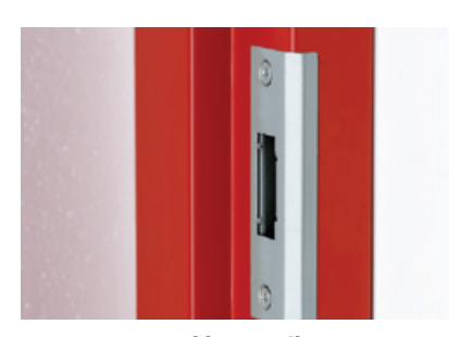
379MDS metal box strike

For customers who prefer machine screws, alternative fixing packs are available.