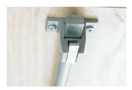
376ELTS - Extra long top shoot

A range of additional or alternative components is available for the 376 Series of exit hardware.